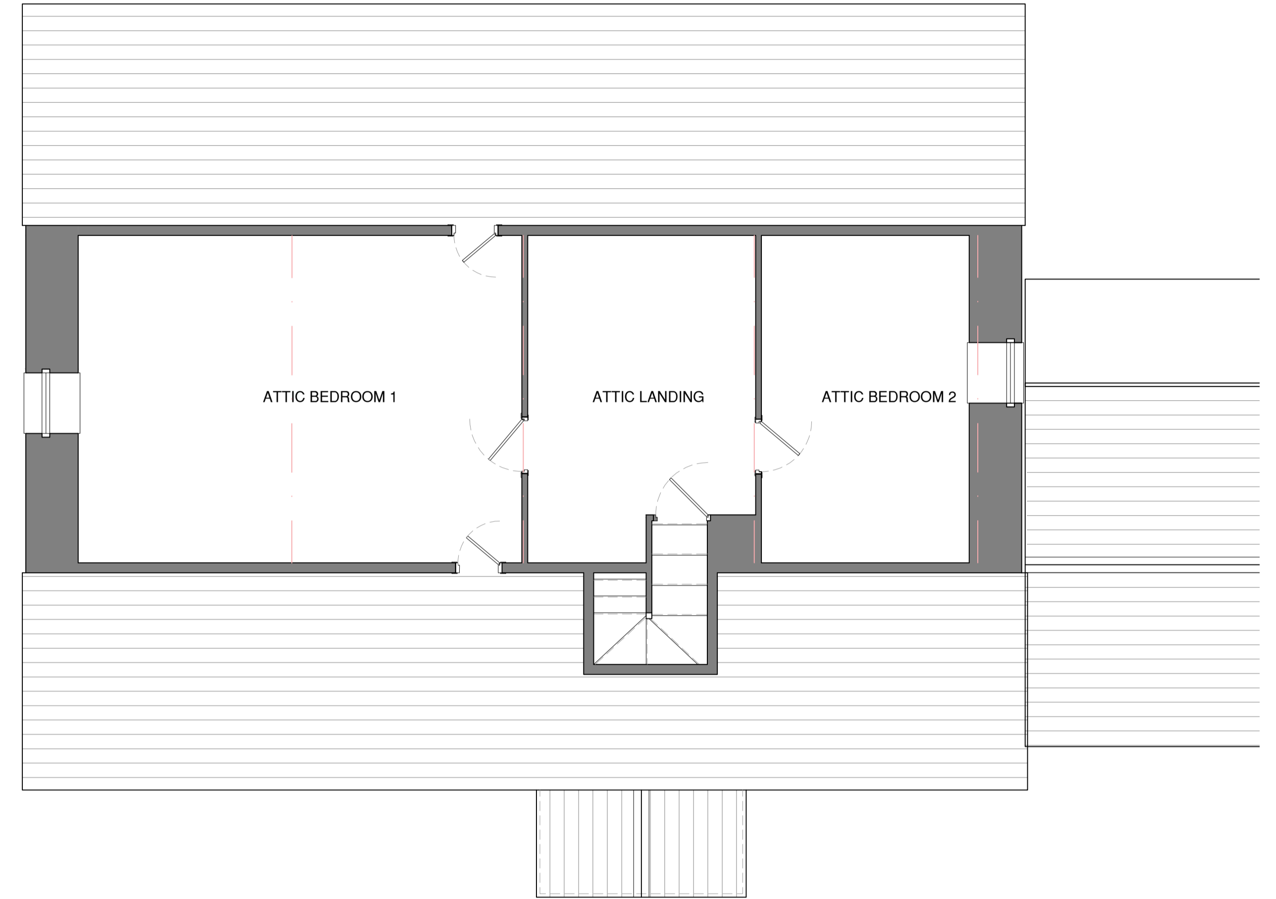
Attic Floor Plan Scale: 1:50