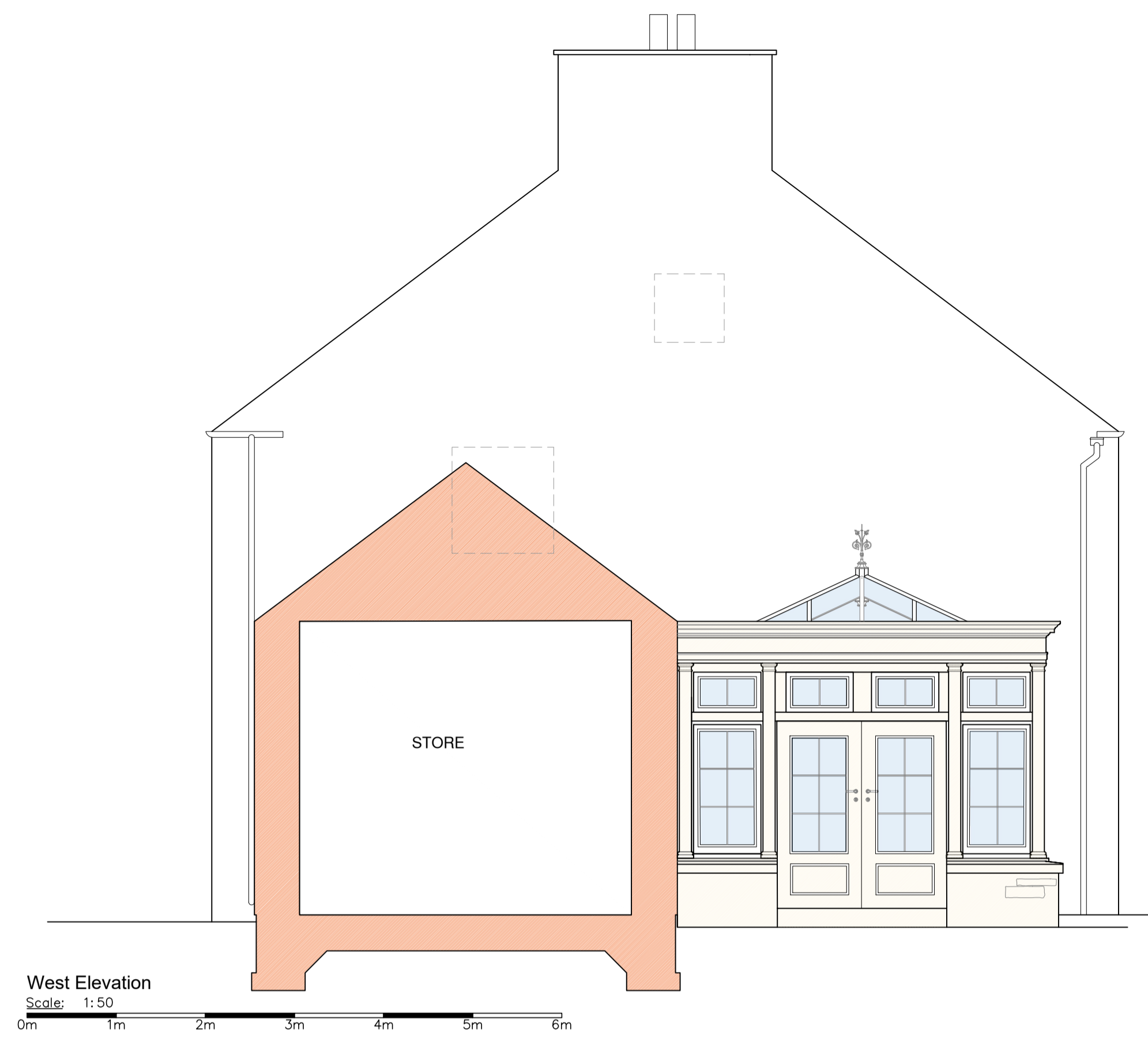
West Elevation Scale: 1:50