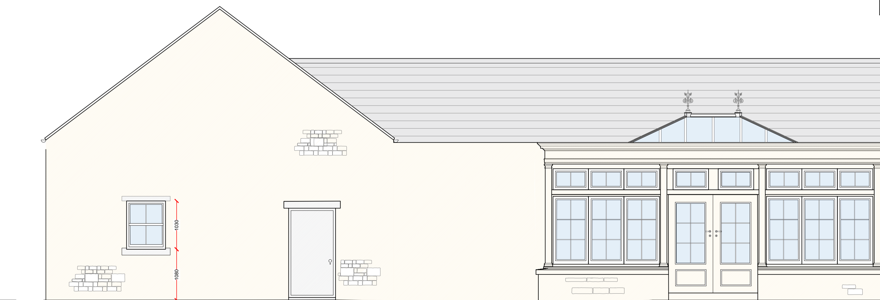
South Elevation Scale: 1:50