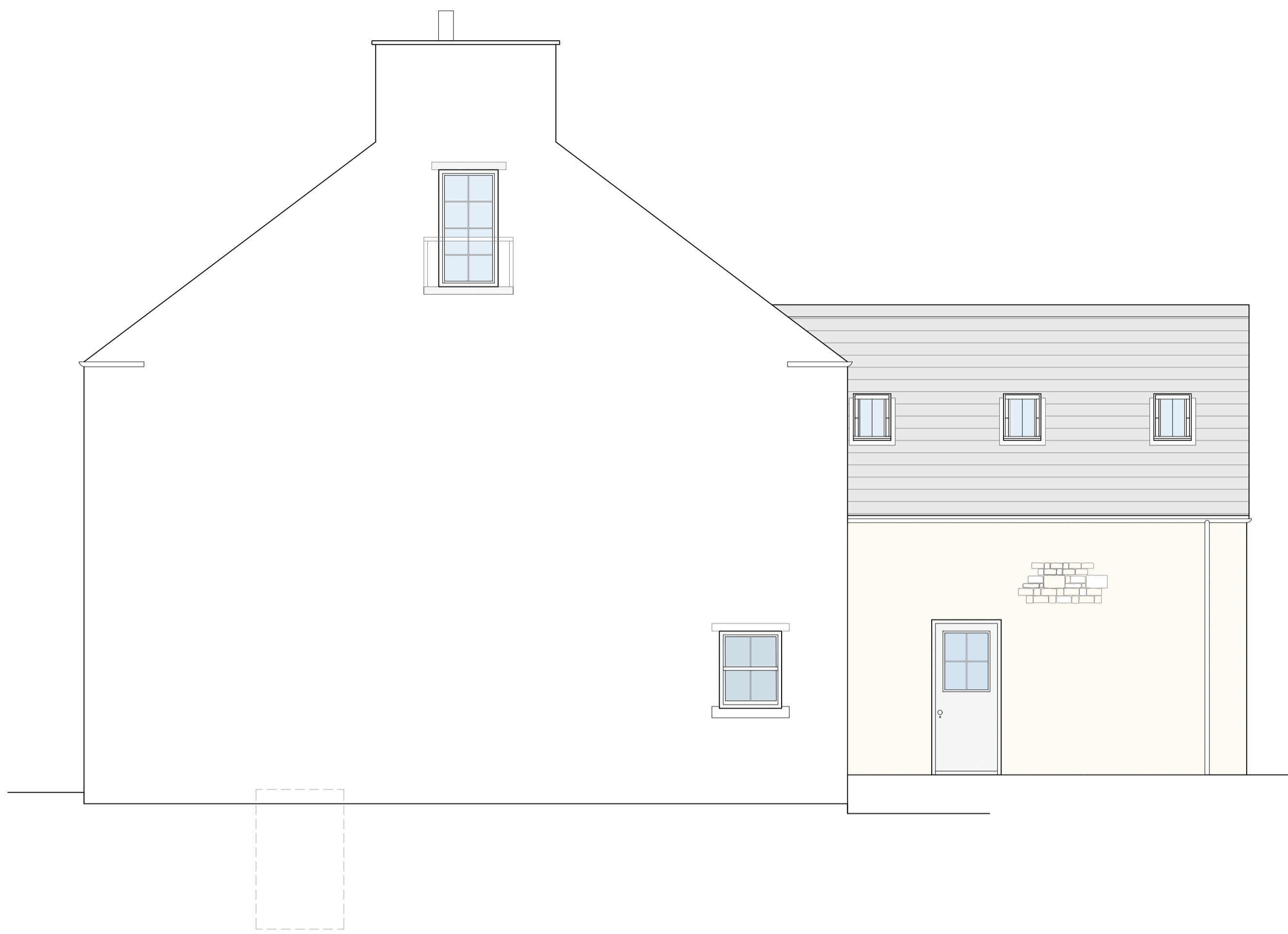
East Elevation Scale: 1:50