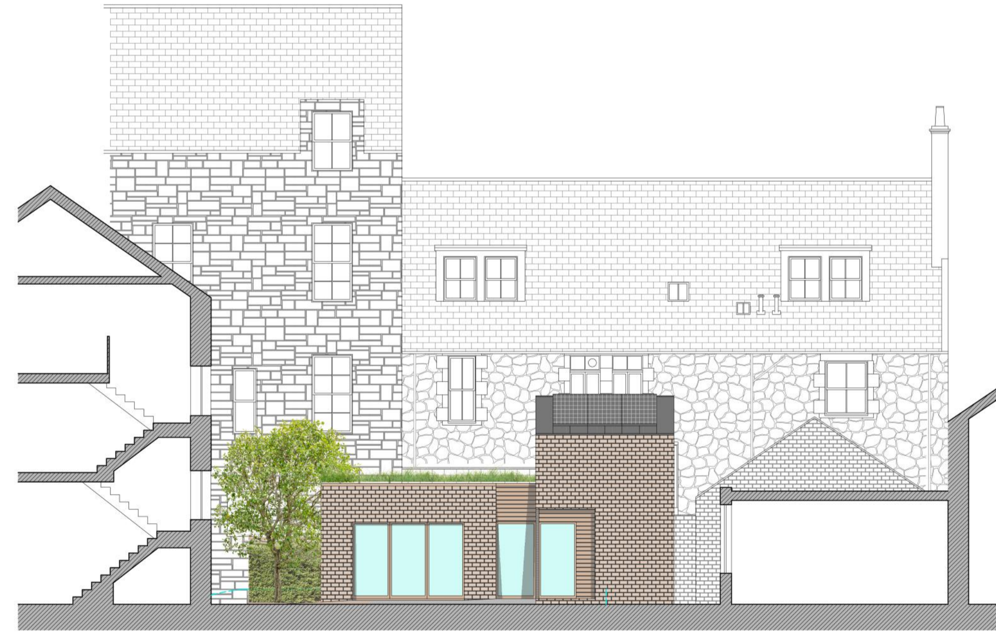
PROPOSED SECTION C:C SOUTH ELEVATION 1:100 @ A1