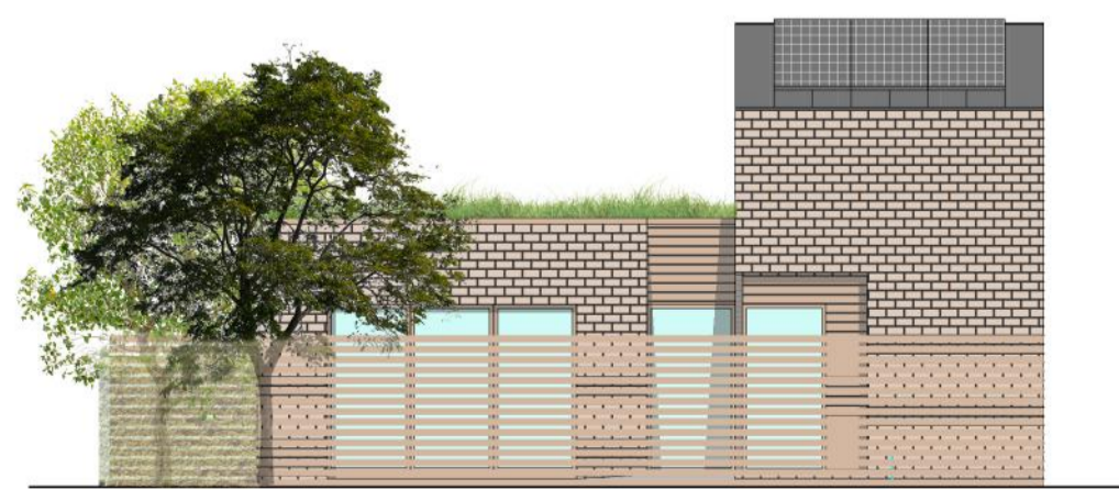
PROPOSED SOUTH ELEVATION including timber fence 1:100 @ A1