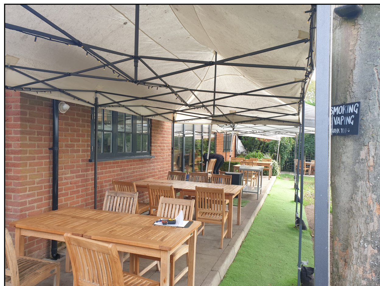
VIEW ALONG REAR ELEVATION