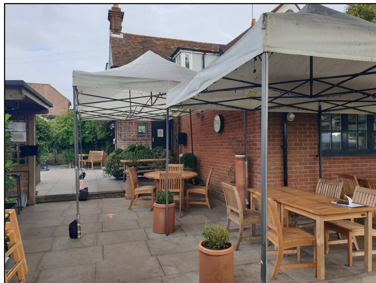
VIEW ALONG SIDE ELEVATION