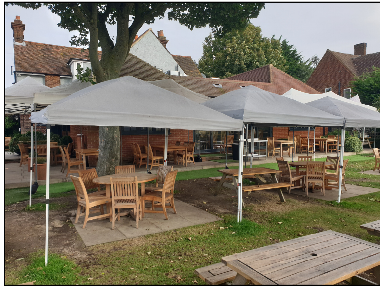
VIEW OF REAR ELEVATION FROM GARDEN