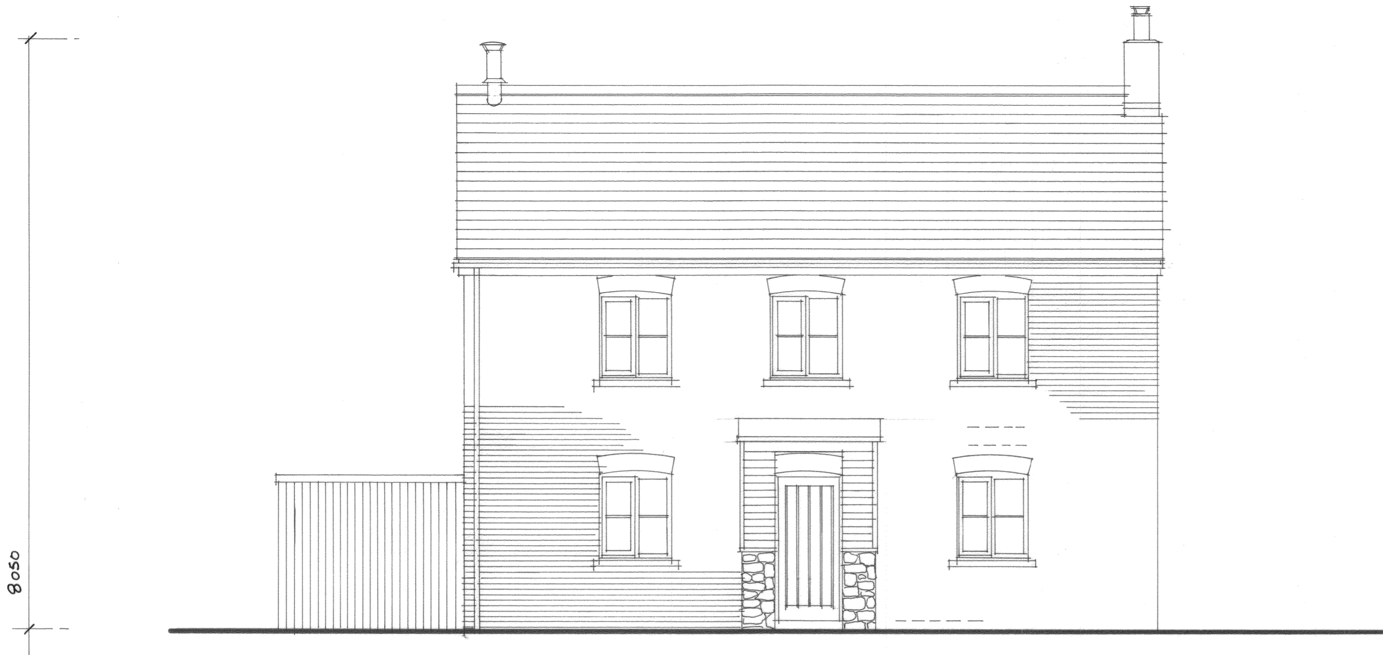
NORTH EAST ELEVATION AS EXISTING.