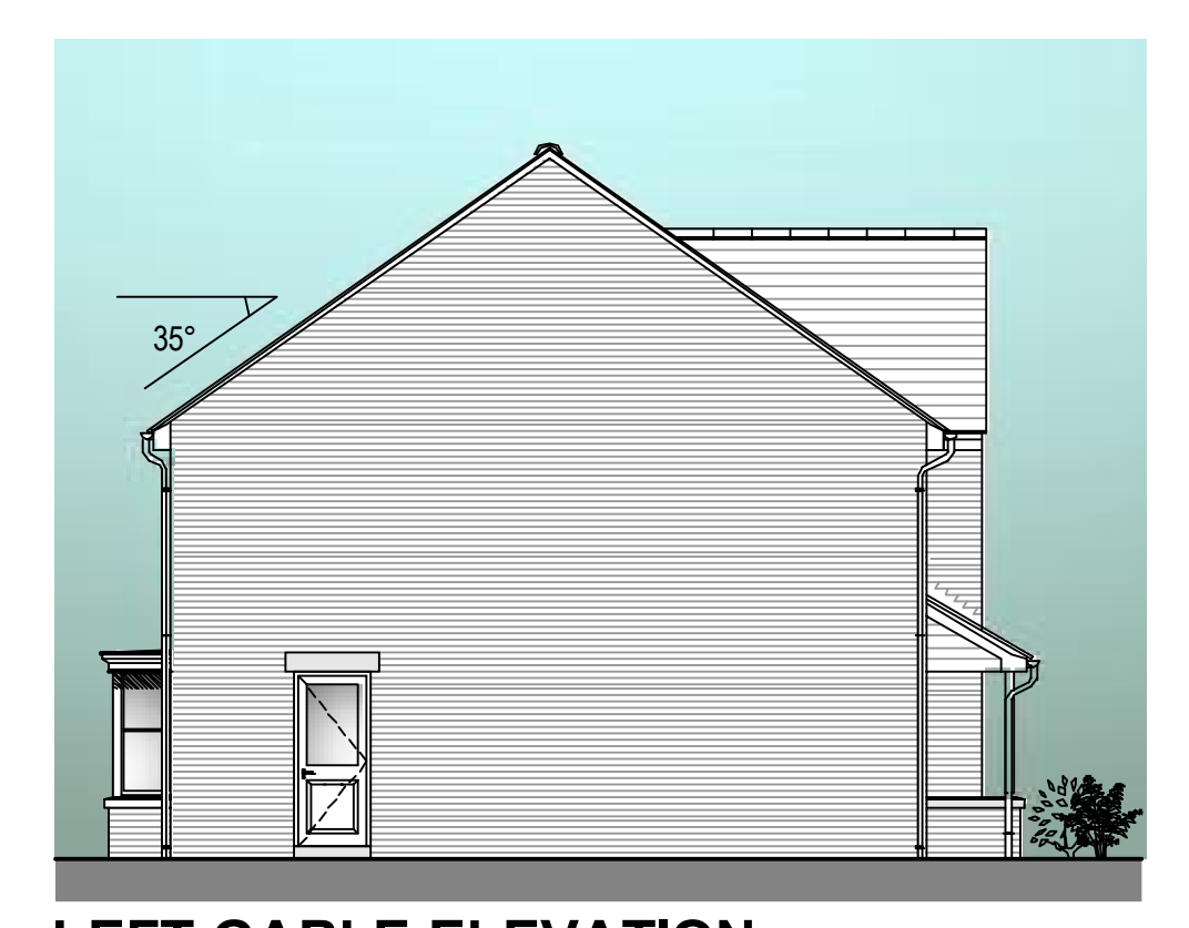
LEFT GABLE ELEVATION

PLANNING DRAWING - ELEVATIONS - 1-100 Scale @ A3