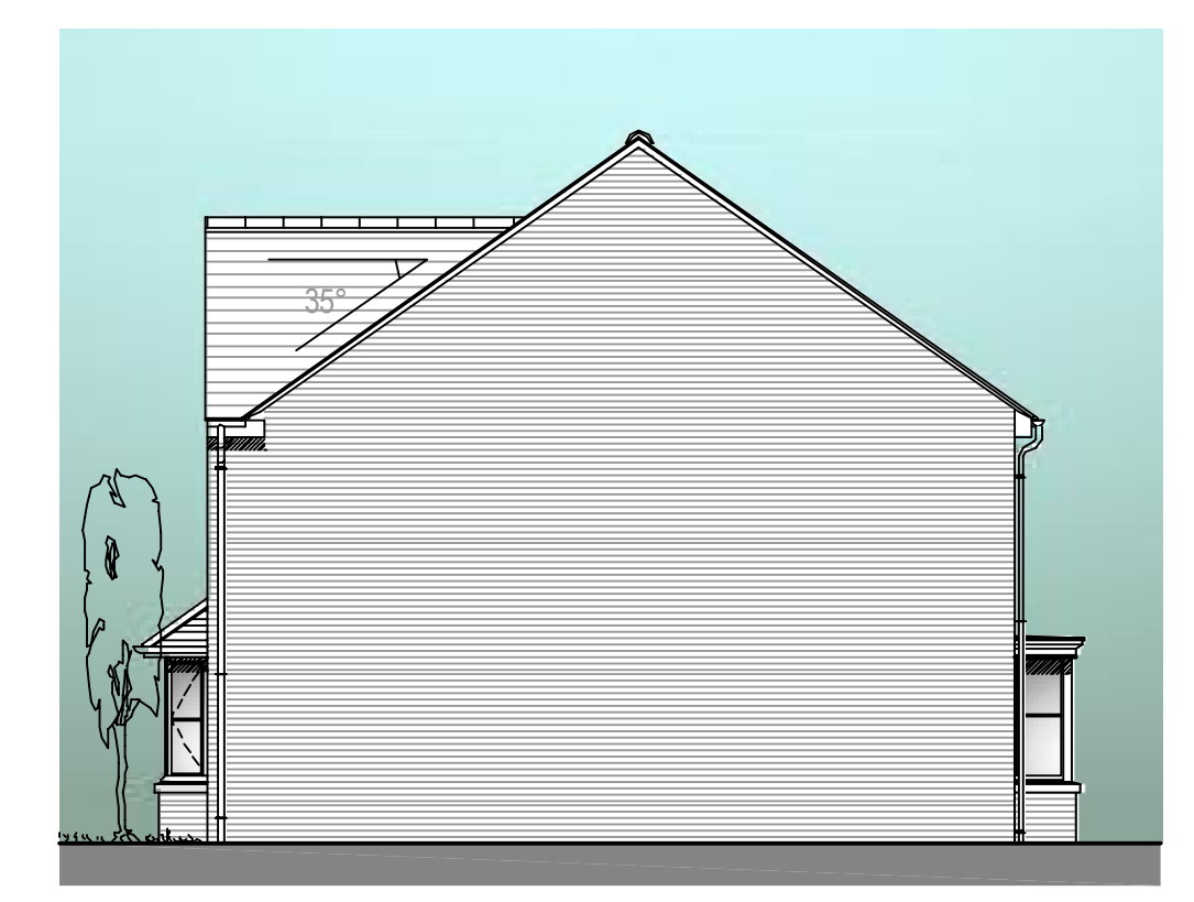
RIGHT GABLE ELEVATION