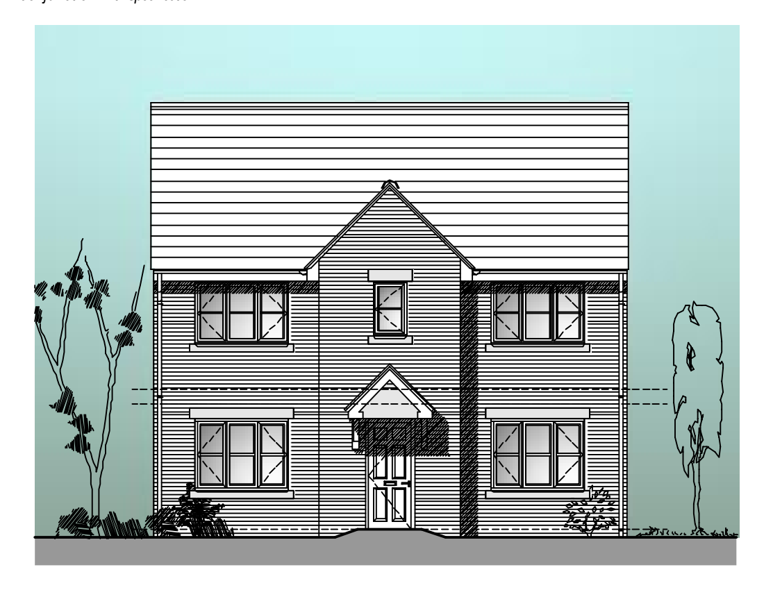
FRONT ELEVATION (Street Elevation)

All drawings are to be read in conjunction with specification.