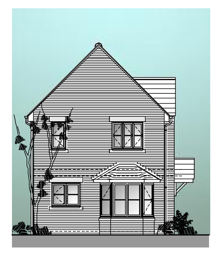
SIDE ELEVATION (Street Elevation)

PLANNING DRAWING - ELEVATIONS - 1-100 Scale @ A3