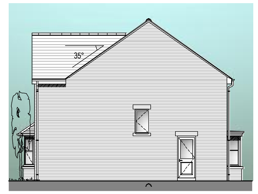
RIGHT GABLE ELEVATION

All drawings are to be read in conjunction with specification.