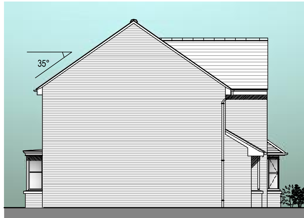
LEFT GABLE ELEVATION