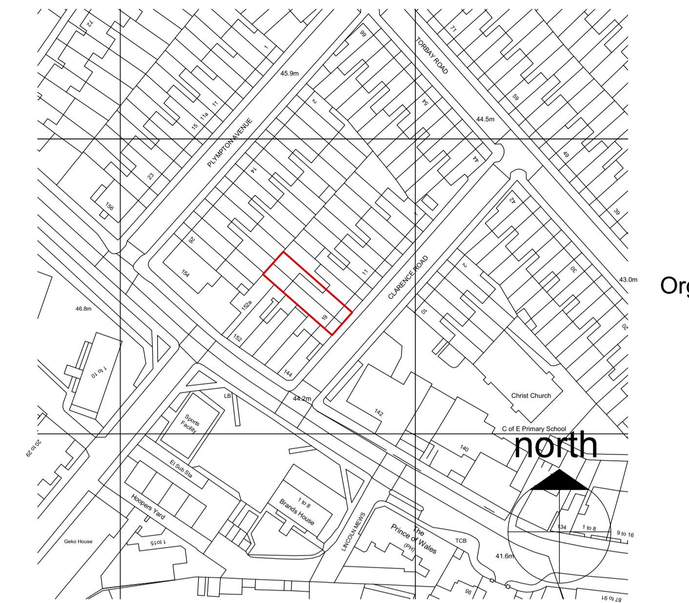
LOCATION PLAN 1:500 @ A1