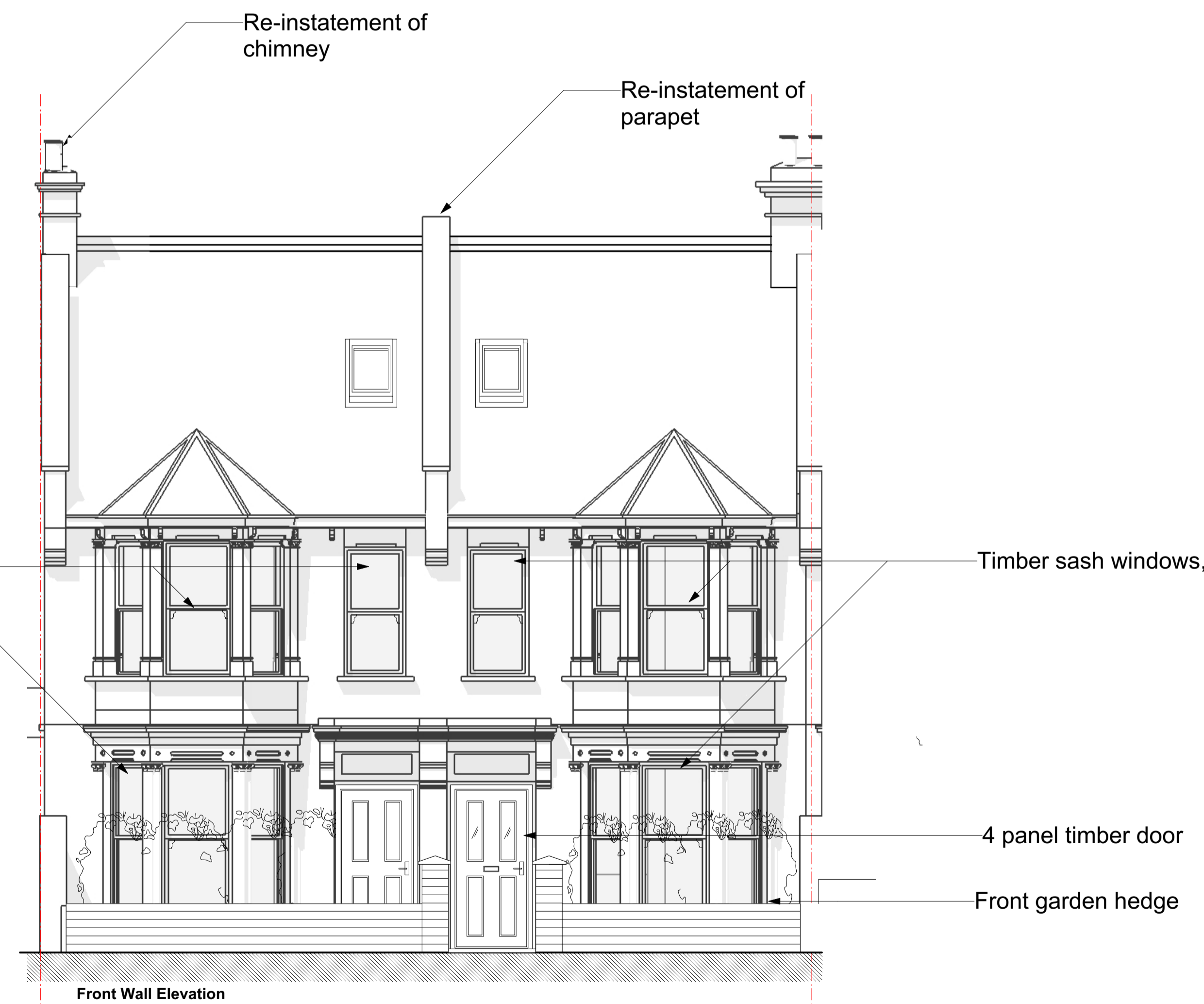
FRONT WALL ELEVATION 1:50 @ A1

drawing notes: This Drawing must not be scaled. Only figured dimensions should be used. Critical site dimensions must be checked on site before proceeding. Any adjoining buildings or features are by way of illustration only and dimensions have not been checked unless specifically noted otherwise. This drawing has been produced for our client for the purposes noted on it and it is not intended for use by any other person for any other purpose. The copyright in this drawing belongs to ZGRP LTD ©. This drawing must not be reproduced in whole or in part or disclosed to any third party unless expressly authorised in writing by a Director of ZGRP LTD.