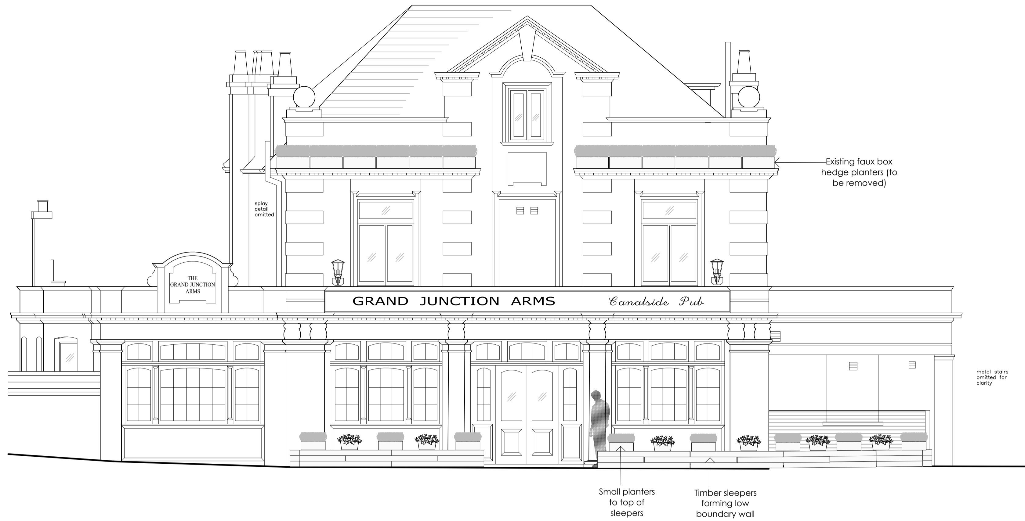
EXISTING FRONT BOUNDARY ELEVATION (EAST) Scale 1:50