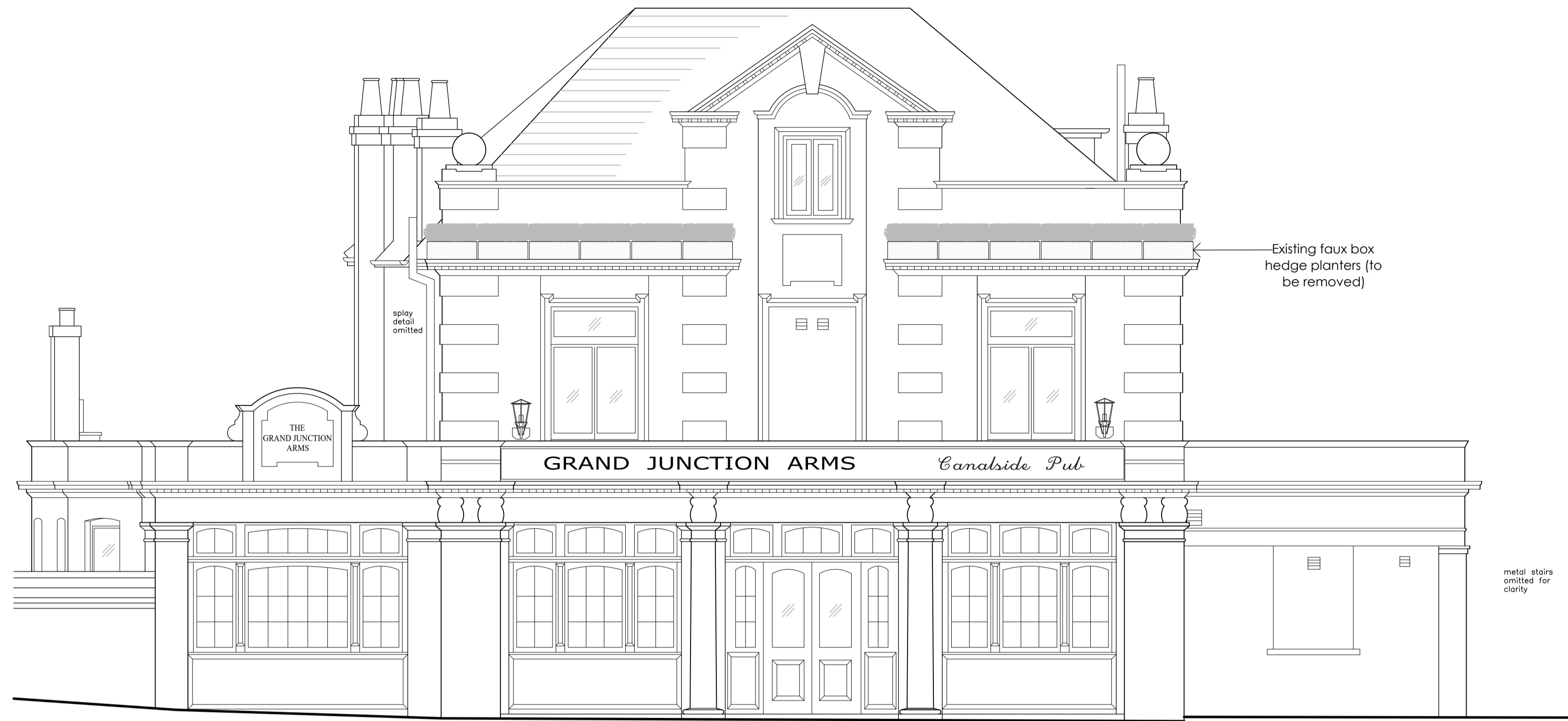
EXISTING FRONT ELEVATION (East) Scale 1:50