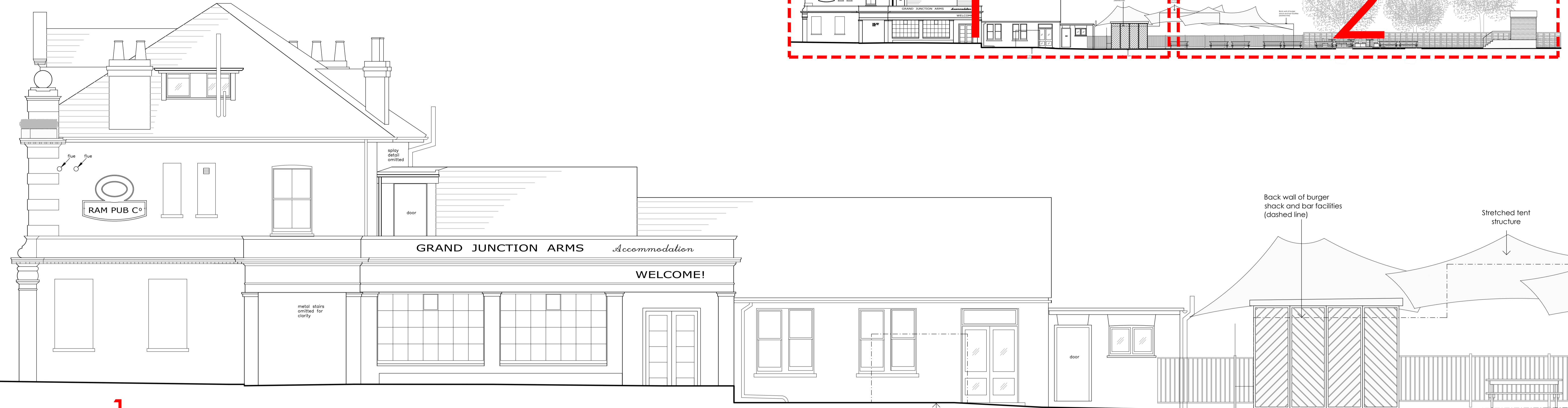
1 EXISTING SIDE ELEVATION (North) Scale 1:50