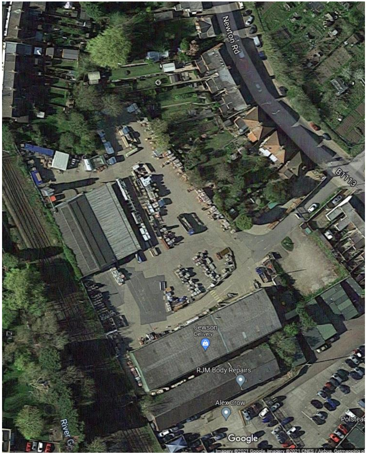
Aerial photo of site