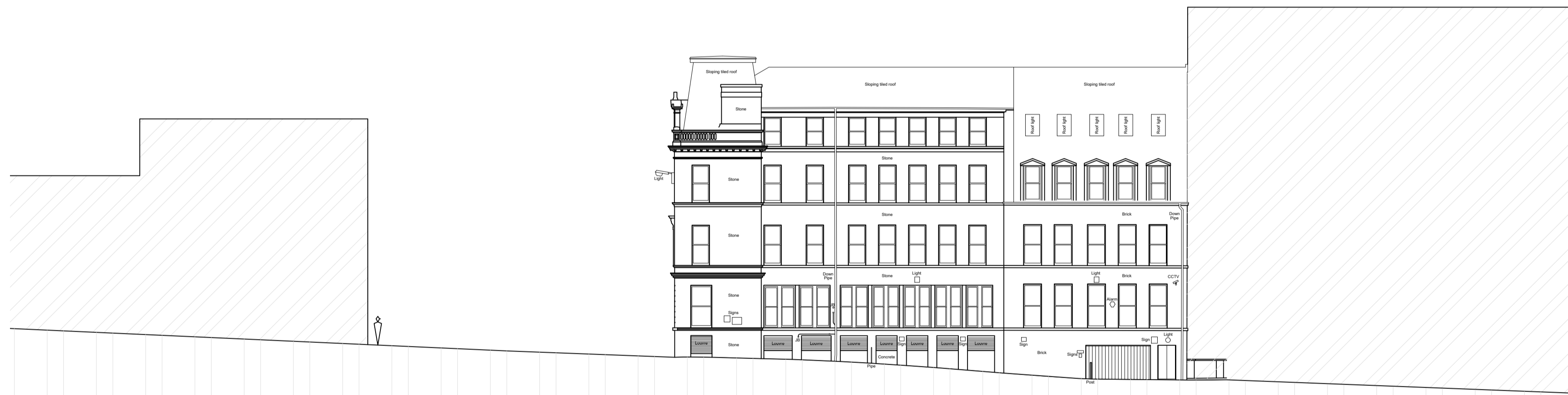
2 Bath Lane - Existing Elevation