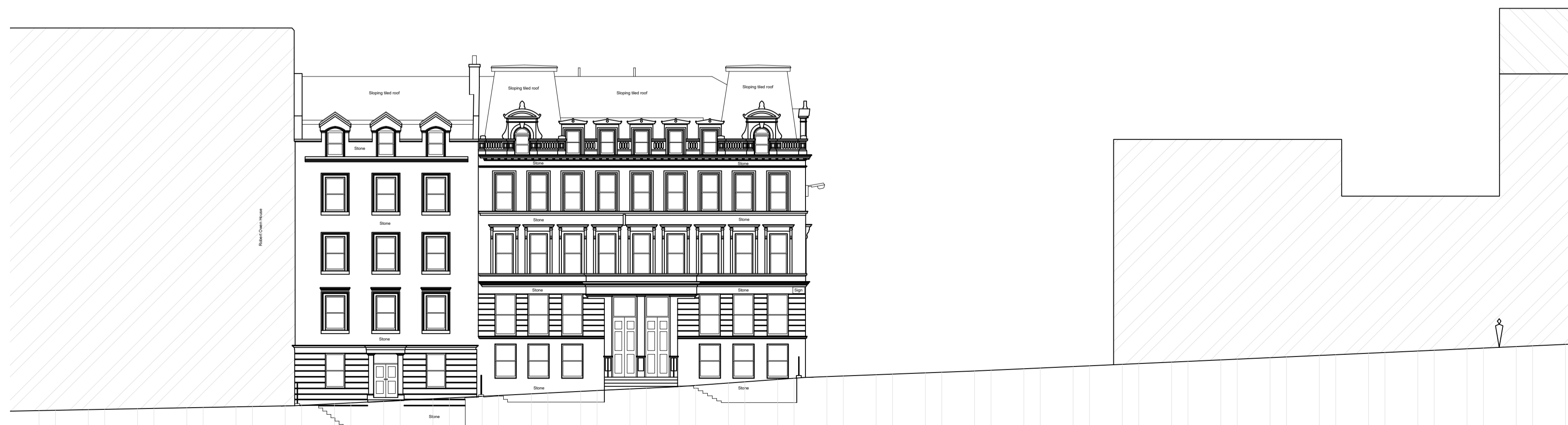
3 Bath Street - Existing Elevation