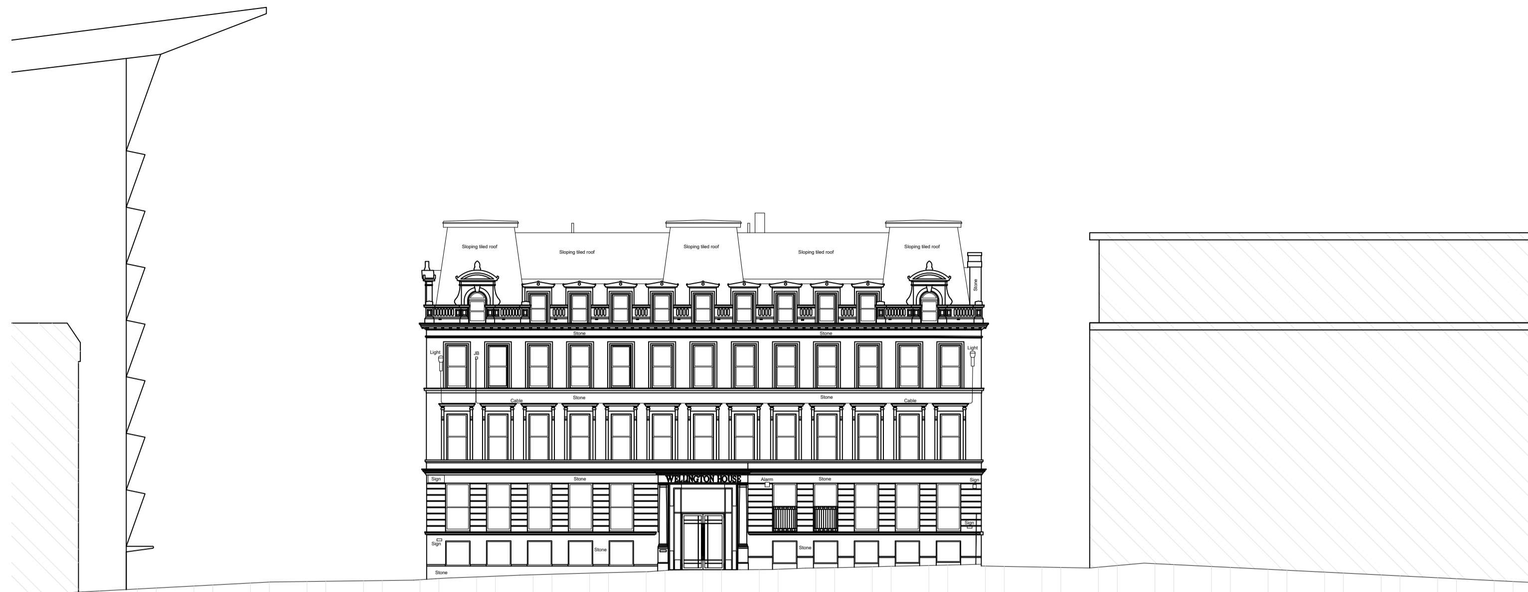
1 Wellington Street - Existing Elevation