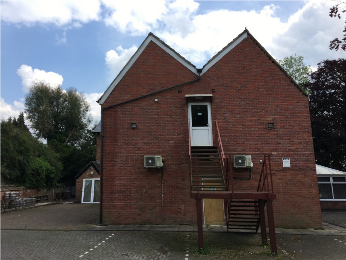
Side of the property looking from the rear: