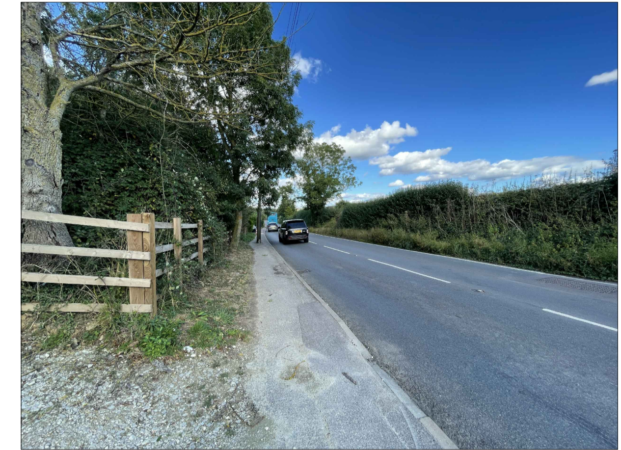
VIEW FROM DRIVE LOCATION View to north