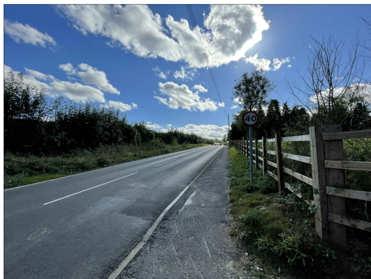
VIEW FROM DRIVE LOCATION View to south