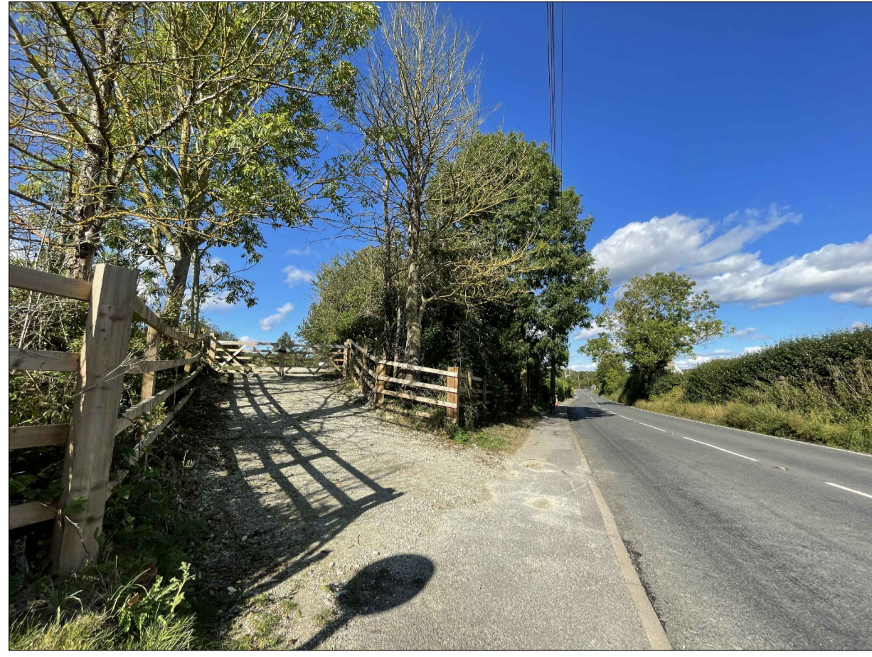
EXISTING DRIVE LOCATION

PLANNING NOTE: THESE DRAWINGS HAVE BEEN PREPARED BY EP Architects Ltd. FOR THE PURPOSE OF ACHIEVING PLANNING APPROVAL ONLY. THIS DOCUMENT IS NOT TO BE USED AS CONSTRUCTION INFORMATION. EP Architects Ltd. ACCEPT NO RESPONSIBILITY FOR ANY INACCURACIES CONTAINED HERE IN OR ARISING FROM THE USE OF THESE DRAWINGS BY THIRD PARTIES.