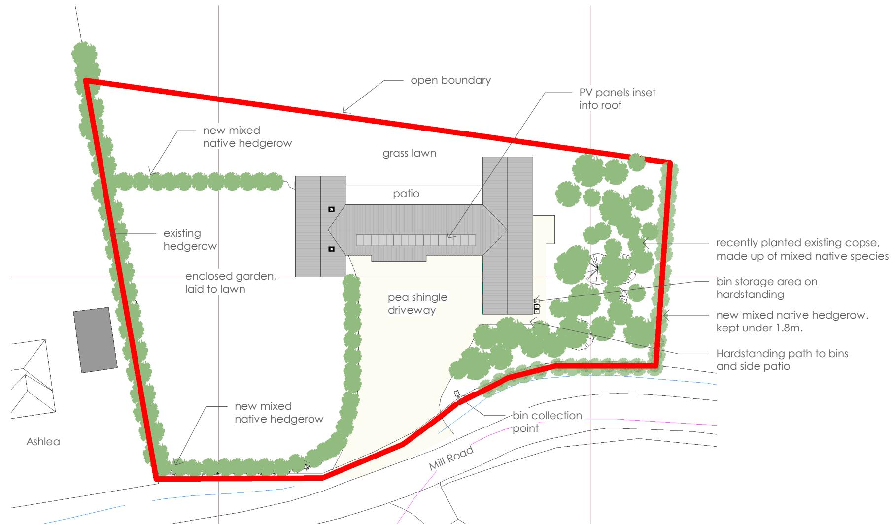
① Block Plan 1 : 500