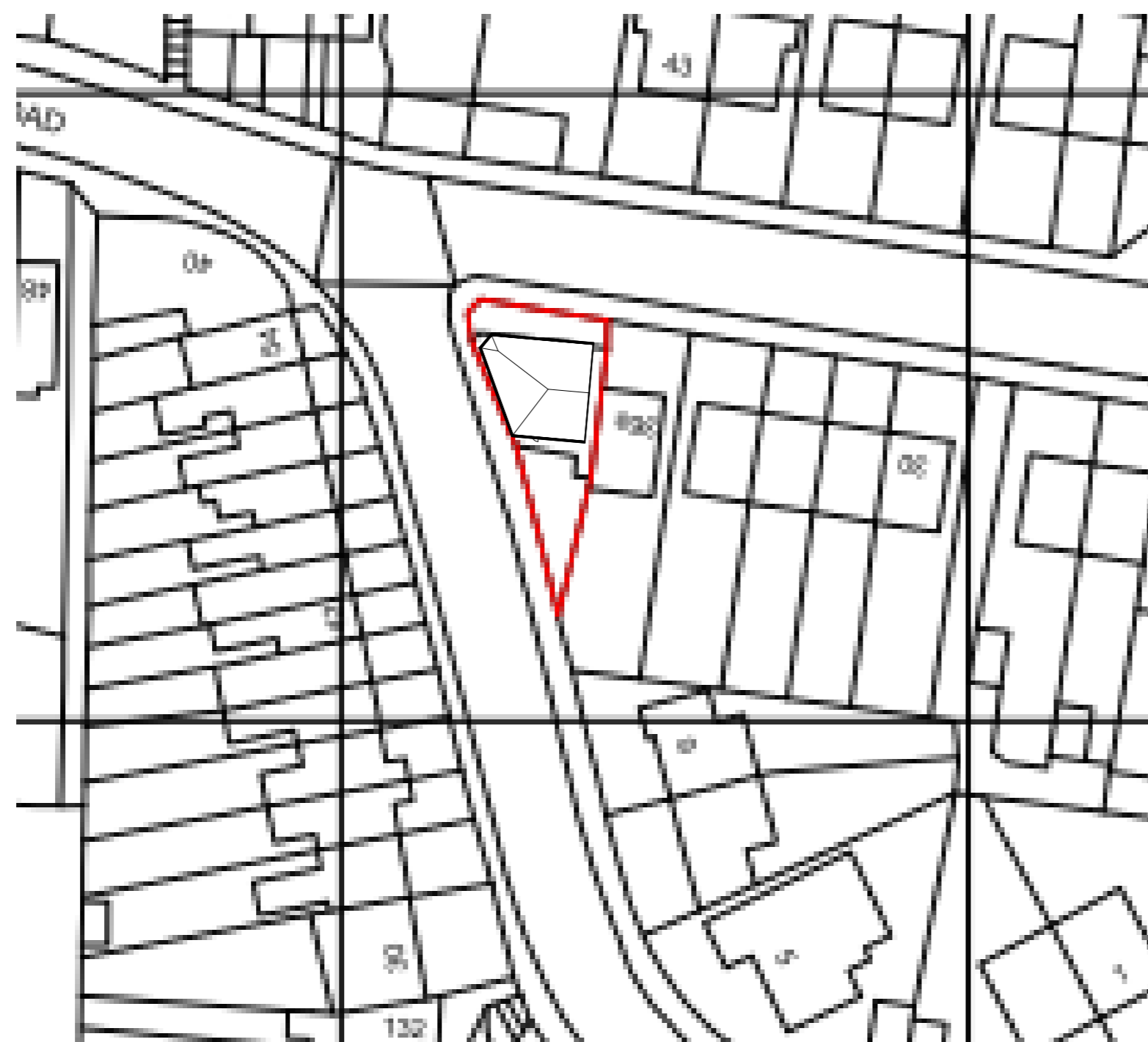
1 Site Block Plan Proposed 1 : 500