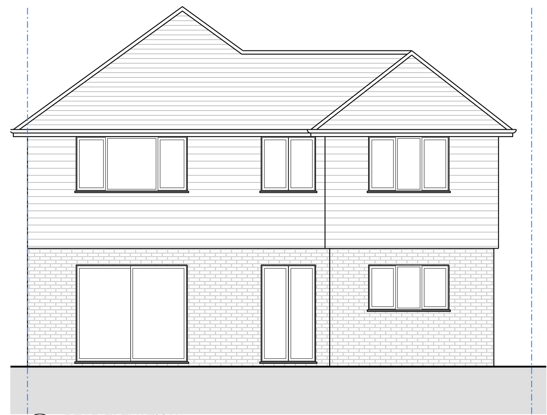
02 REAR ELEVATION EXISTING