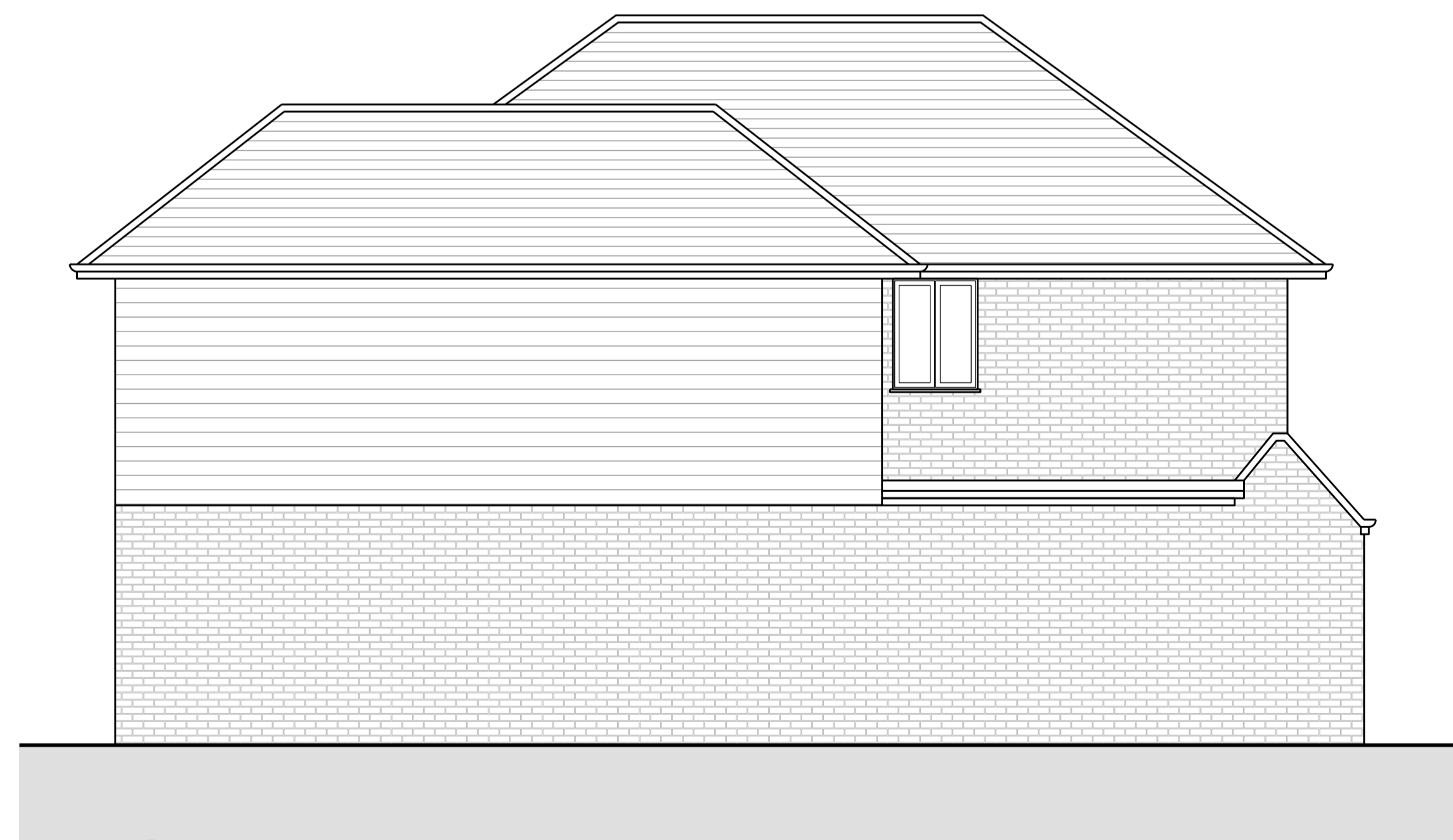
03 SIDE ELEVATION EXISTING