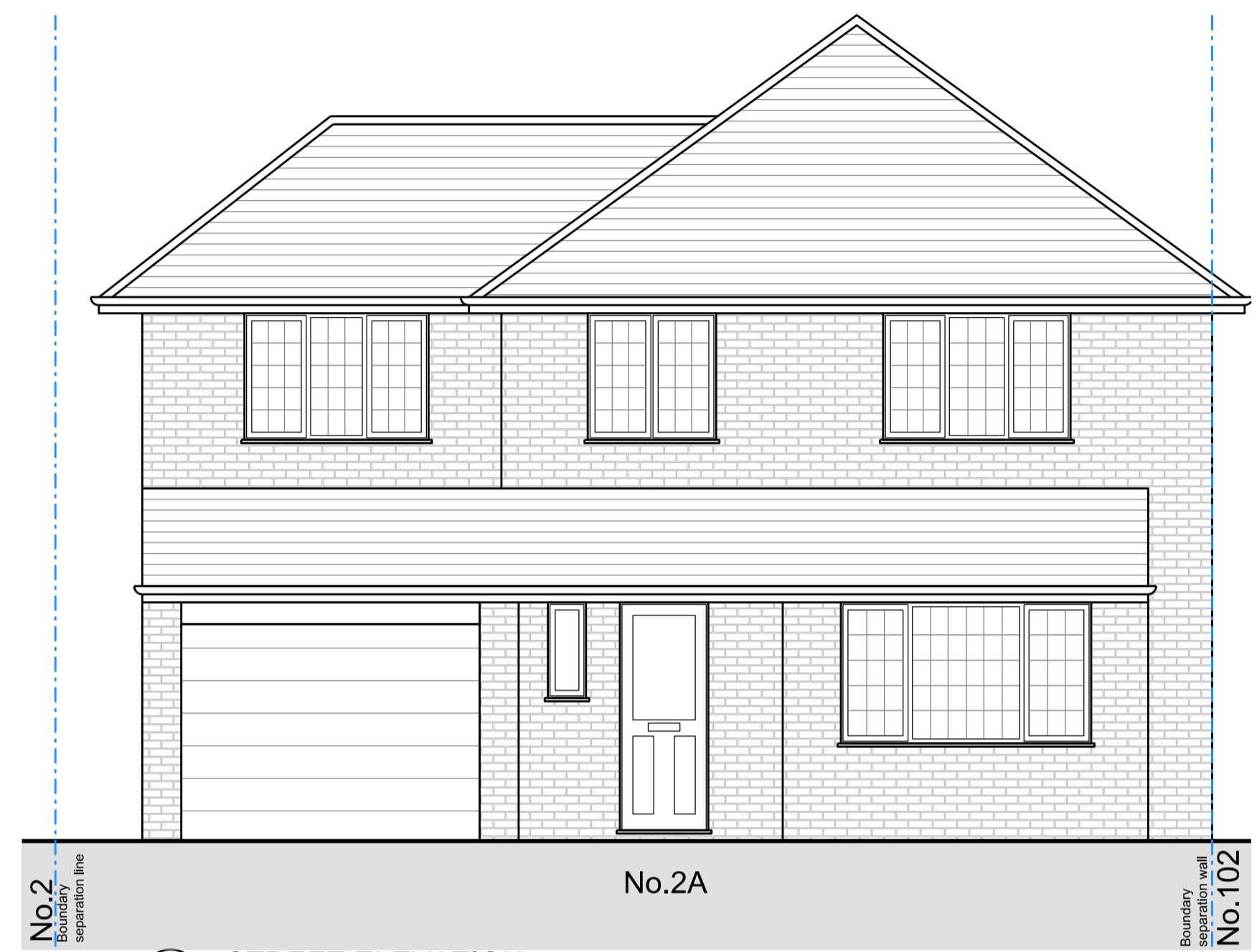
01 STREET ELEVATION EXISTING