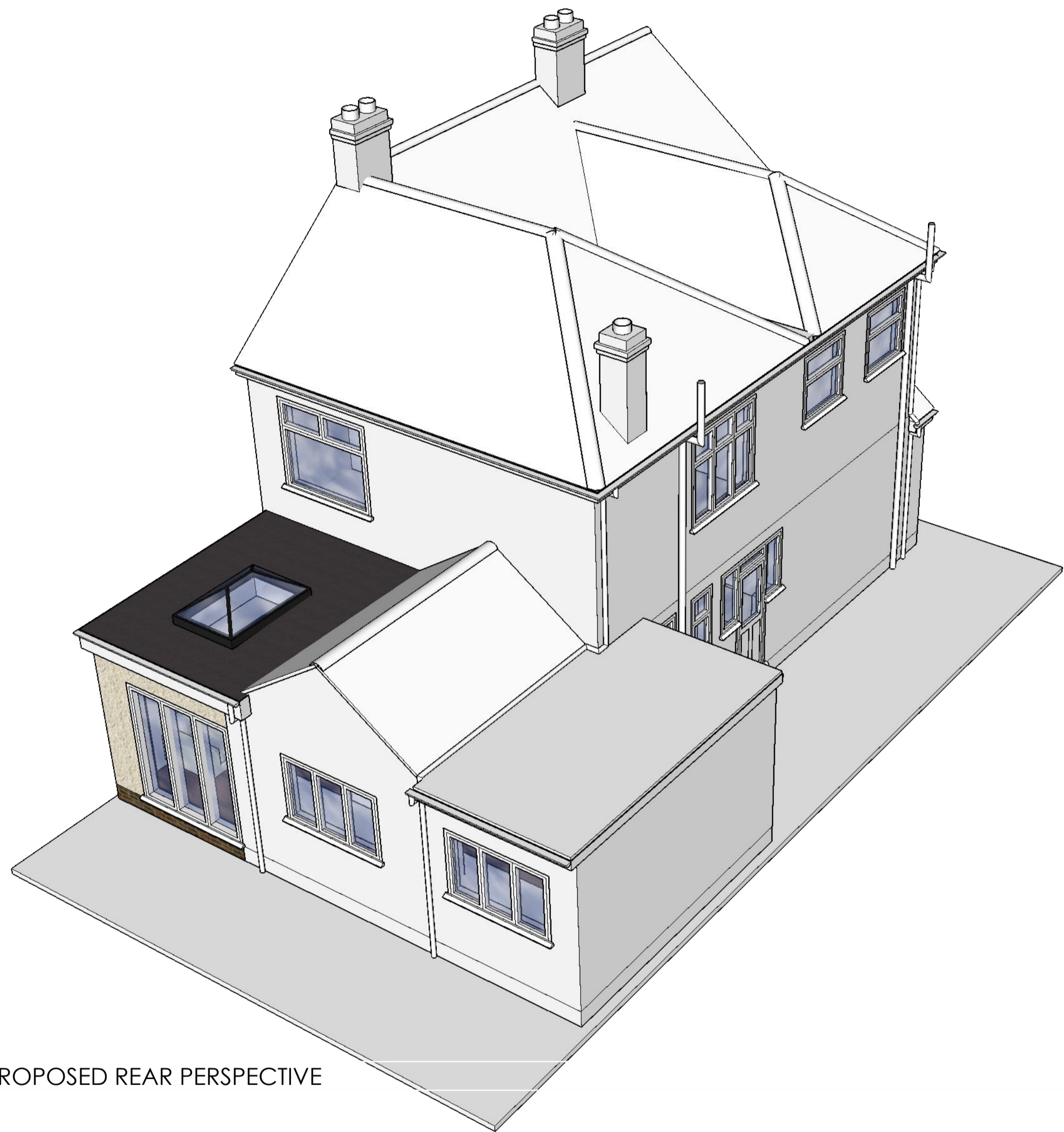
PROPOSED REAR PERSPECTIVE