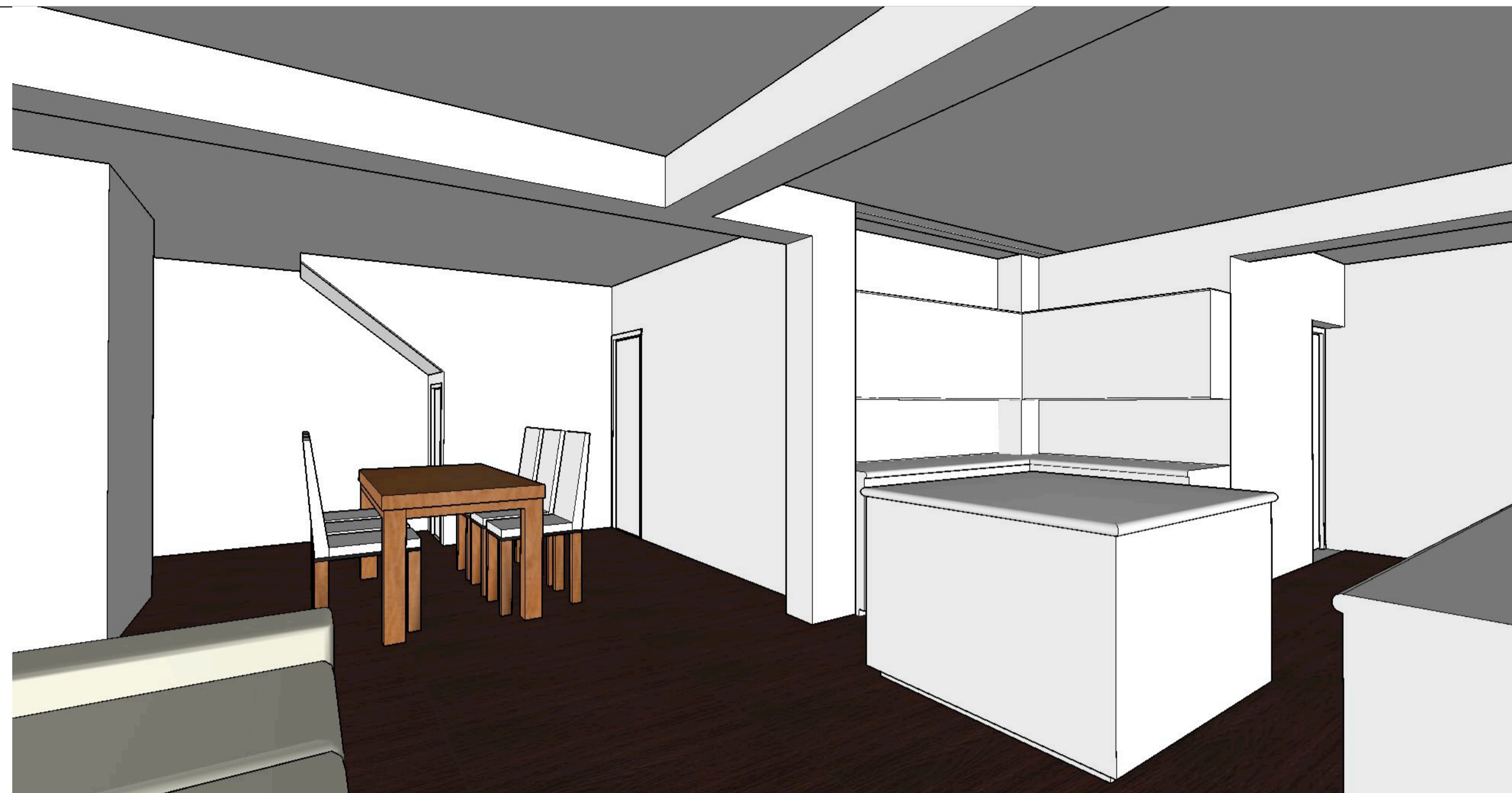
VIEW FROM SEATING AREA