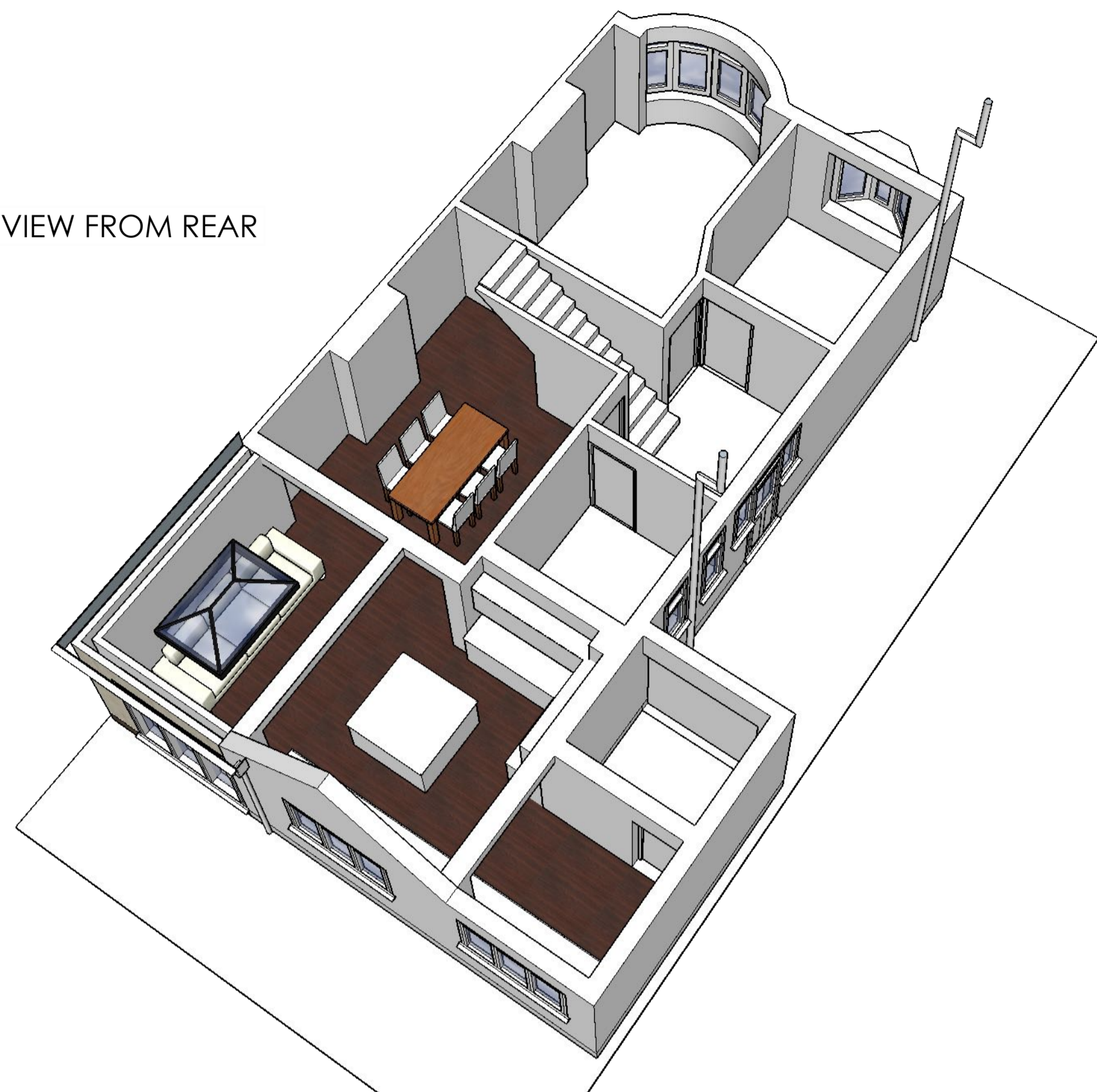
OVERVIEW FROM REAR