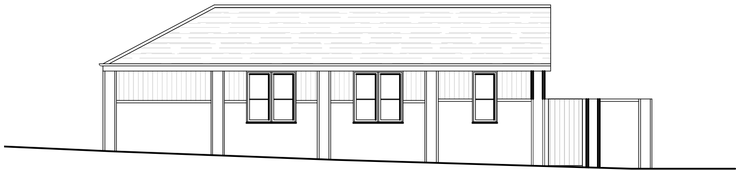
Proposed Stable North-West Elevation - 1/100