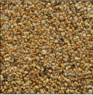
DRIVE TO BE RESURFACED AND FINISHED IN RESIN BONDED GRAVEL