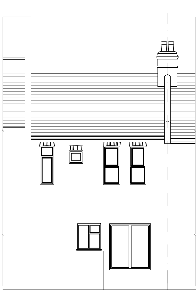
PRE-EXISTING REAR ELEVATION