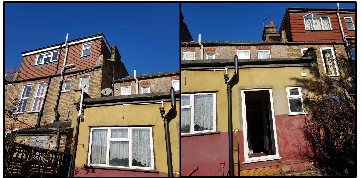
CURRENT PHOTO - 2021