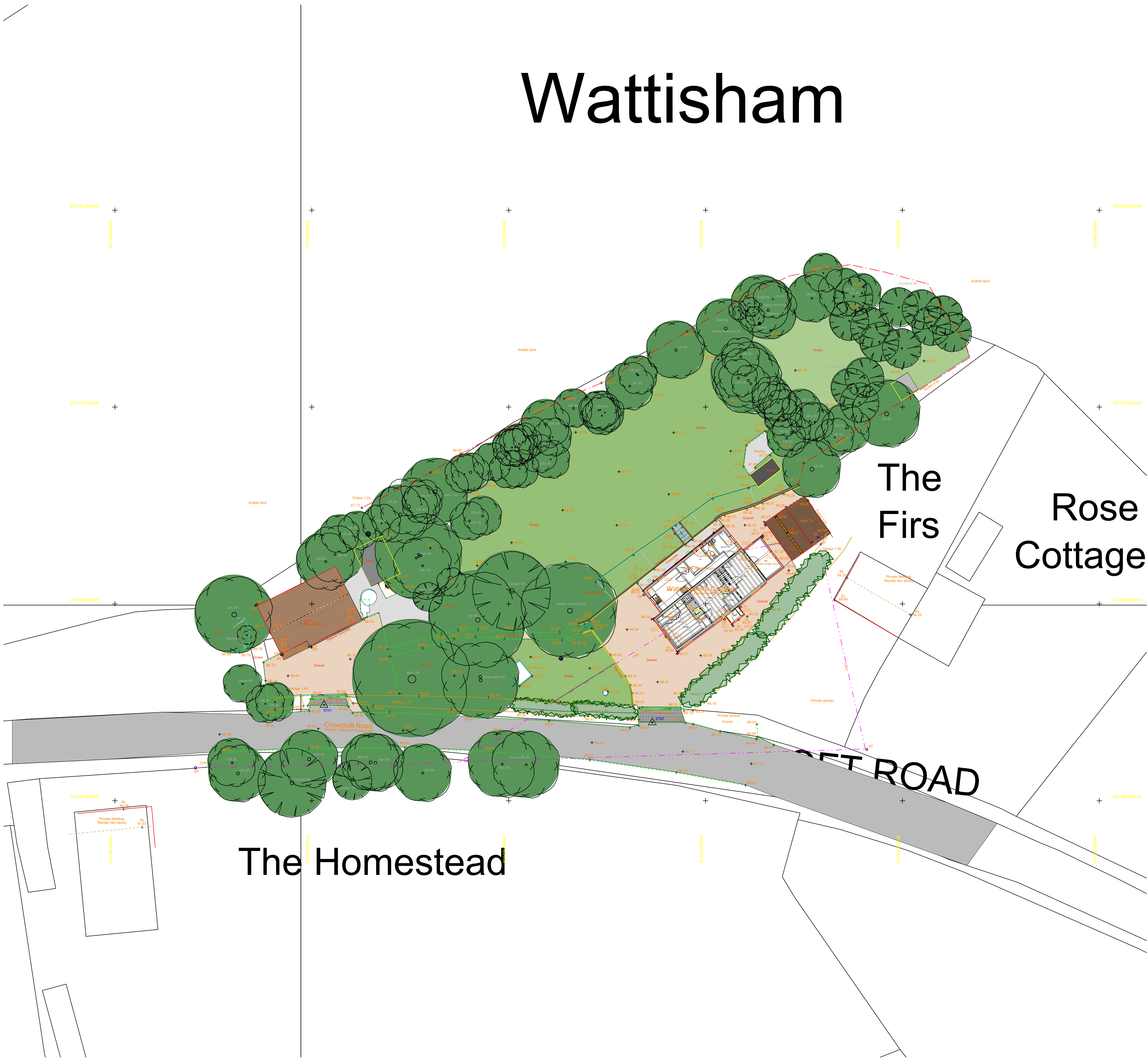
SITE PLAN 1:200 scale

General Notes 1. Do not scale this drawing. All dimensions to be noted. Contractor to check all dimensions on site before carry out works. 2. This drawing is for the private and confidential use of the client for whom it was undertaken and it should not be reproduced in whole or in part or relied upon by third parties for any use without the express written authority of Beech Architects Limited.