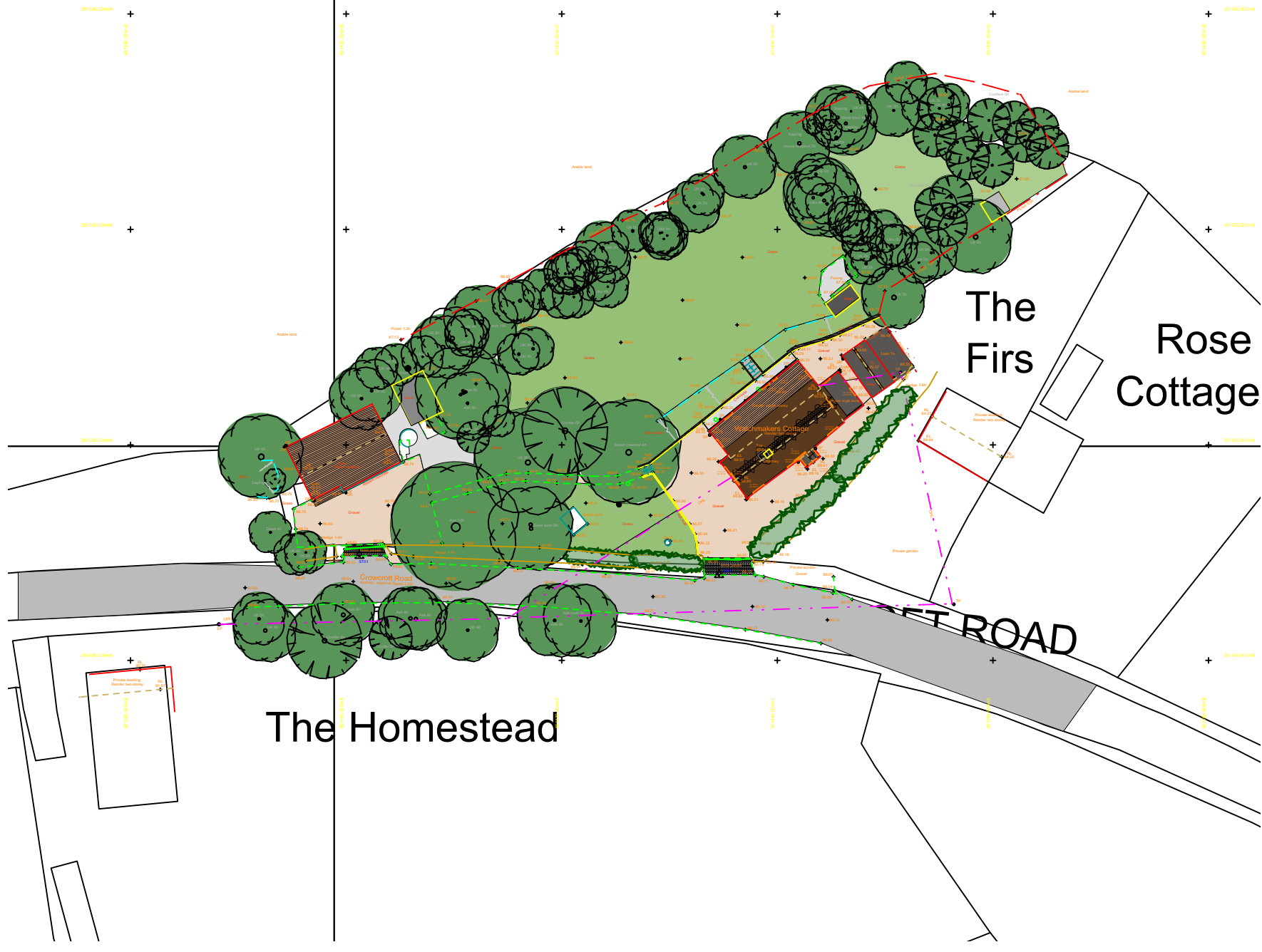
BLOCK PLAN 1:500 scale