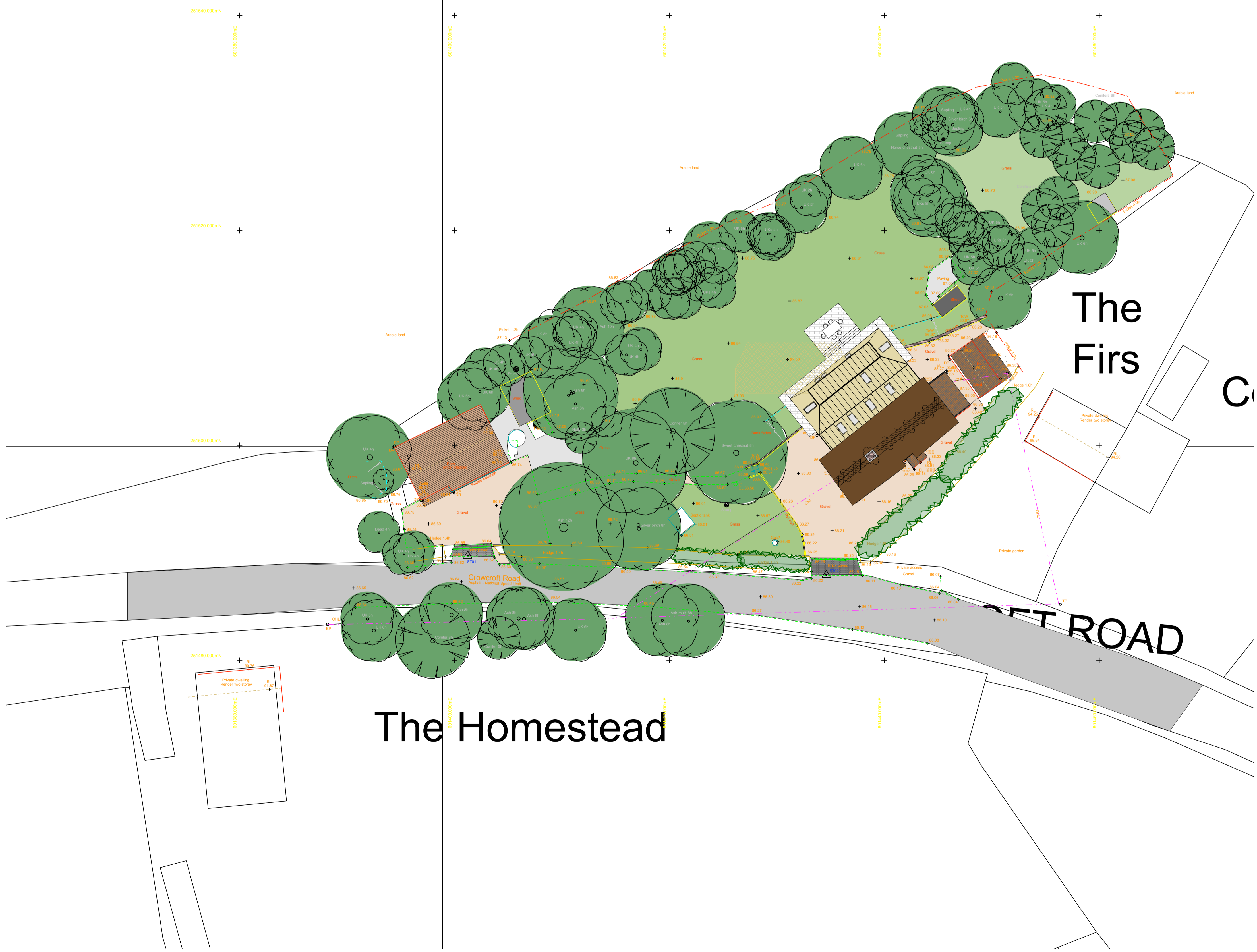
SITE PLAN 1:200 scale

D - 2/10/21 - Planning C - 28/5/21 - Planning B - 2/5/21 - Plans updated Rev A - 11/4/21 - Plans updated