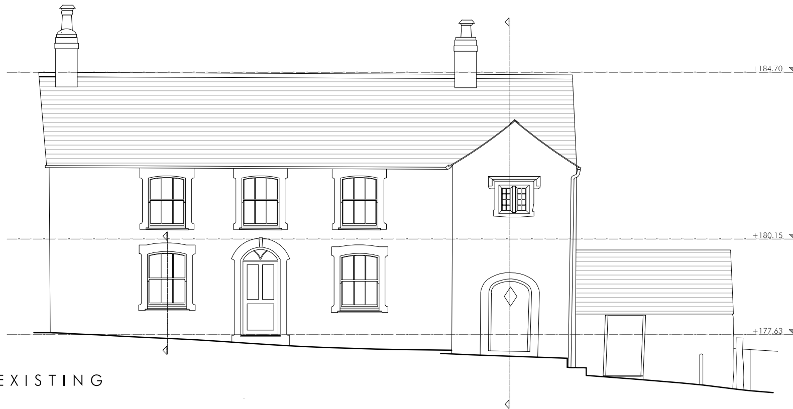
SOUTH ELEVATION AS EXISTING SCALE 1:100 @ A3