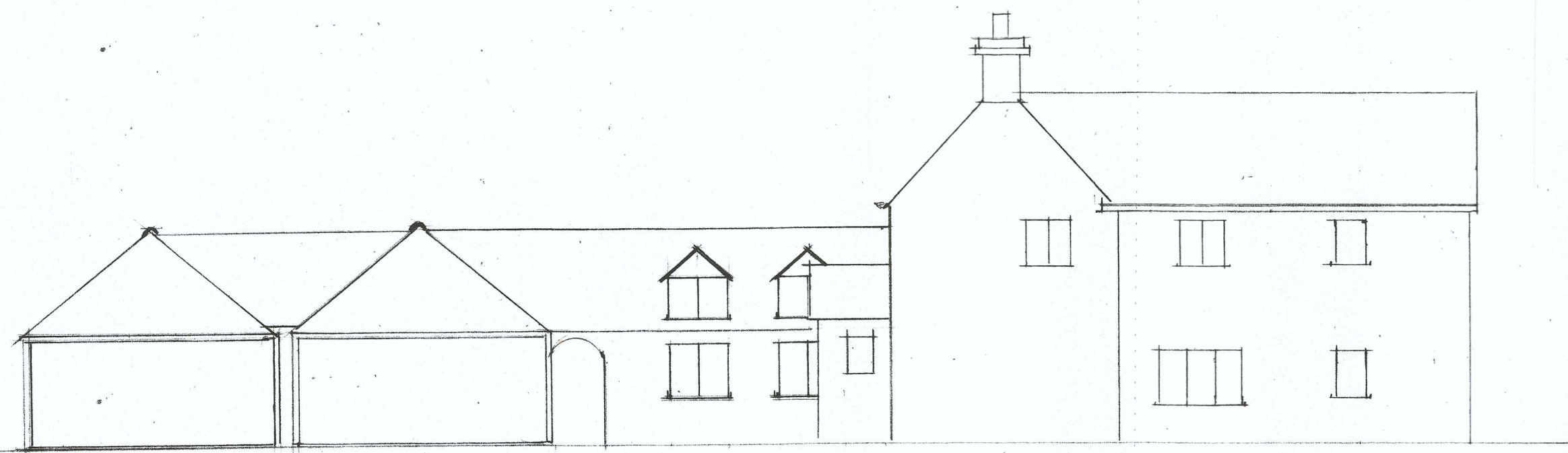
PROPOSED ELEVATION B

MR + MRS R WHITE GROVE END FARM GORST HILL ROCK NE BEWDLEY WORCS. DY 14 9YQ