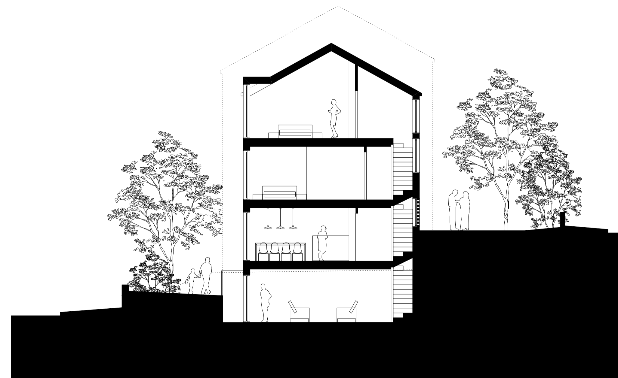
PROPOSED SECTION BB 1:100 @ A1