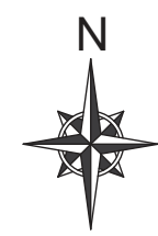
Site Plan - As Proposed 1:500

Example Picture of LED light source (Italo3 by AEC Illuminazione or similar), to be wall mounted via a bracket, to be fitted with asymmetrical optic in order to guide the light to the car park only.