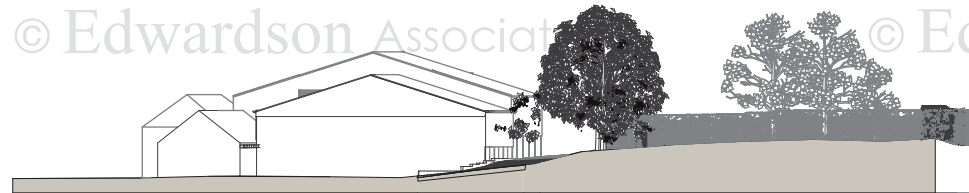
Site Section A 1:500