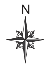
Site Plan - As Existing 1:500

Paddock House, 10 Middle Street South Driffield, East Yorkshire, YO25 6PT tel: 01377 249720 fax: 01377 259052 info@edwardsonassociates.com www.edwardsonassociates.com