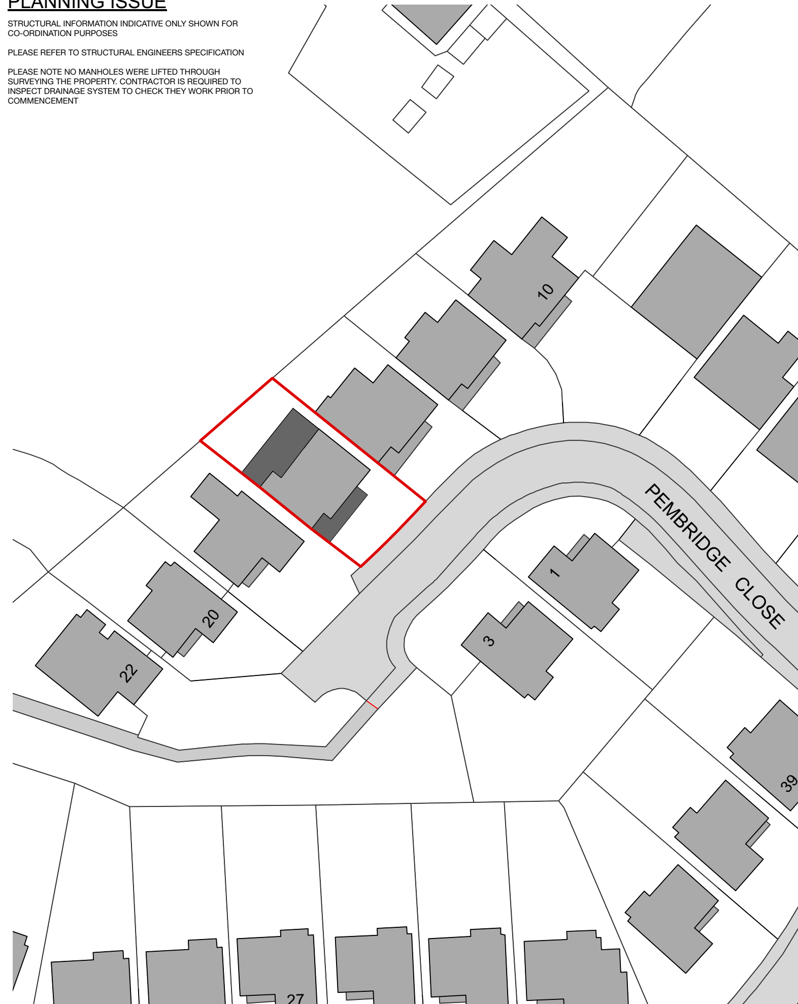
PROPOSED BLOCK PLAN 1:500 @ A3

PLEASE NOTE NO MANHOLES WERE LIFTED THROUGH SURVEYING THE PROPERTY. CONTRACTOR IS REQUIRED TO INSPECT DRAINAGE SYSTEM TO CHECK THEY WORK PRIOR TO COMMENCEMENT