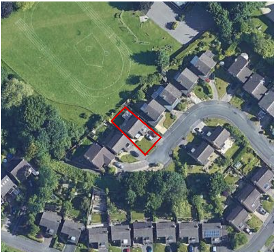
SATELLITE IMAGE NOT TO SCALE