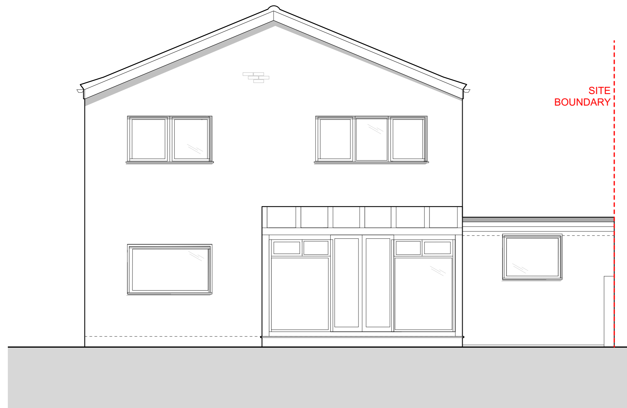
2 NORTH WEST ELEVATION 1:50 @ A1 / 1:100 @ A3