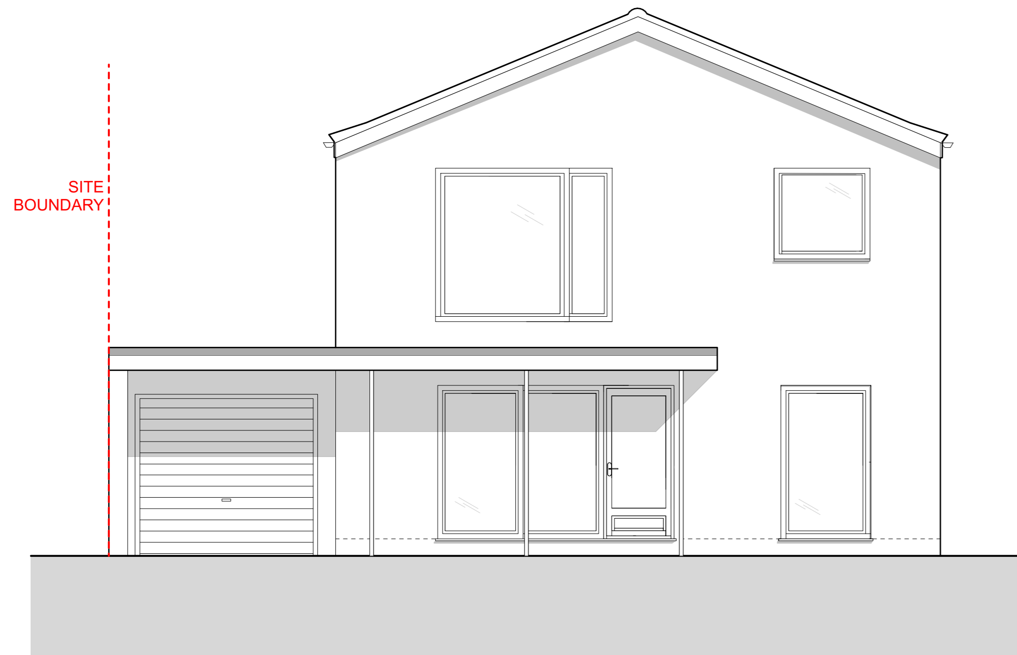
1 SOUTH EAST ELEVATION 1:50 @ A1 / 1:100 @ A3

PLEASE NOTE NO MANHOLES WERE LIFTED THROUGH SURVEYING THE PROPERTY. CONTRACTOR IS REQUIRED TO INSPECT DRAINAGE SYSTEM TO CHECK THEY WORK PRIOR TO COMMENCEMENT