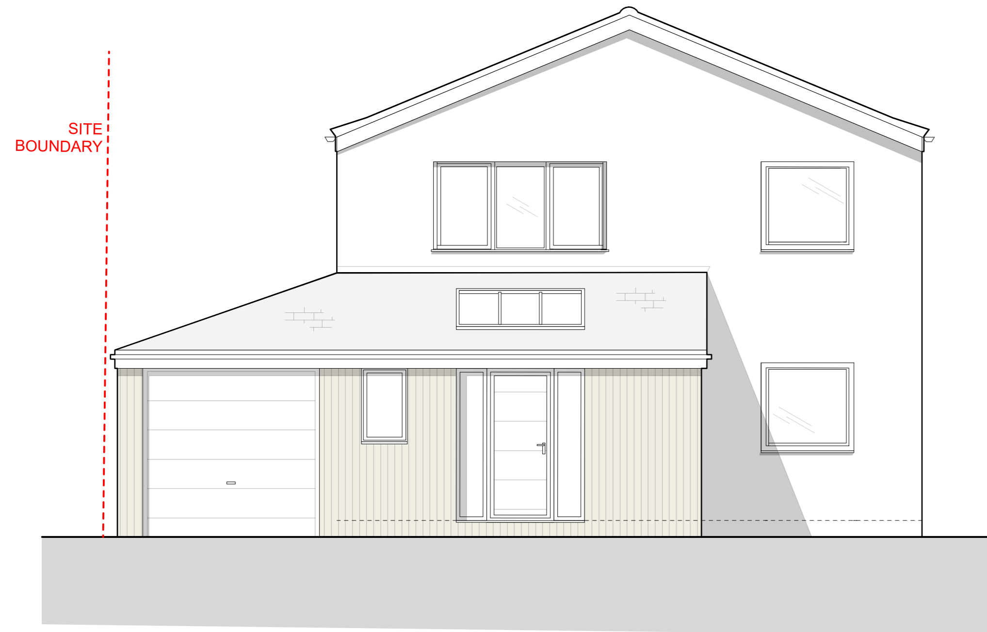
1 SOUTH EAST ELEVATION

PLEASE NOTE NO MANHOLES WERE LIFTED THROUGH SURVEYING THE PROPERTY. CONTRACTOR IS REQUIRED TO INSPECT DRAINAGE SYSTEM TO CHECK THEY WORK PRIOR TO COMMENCEMENT