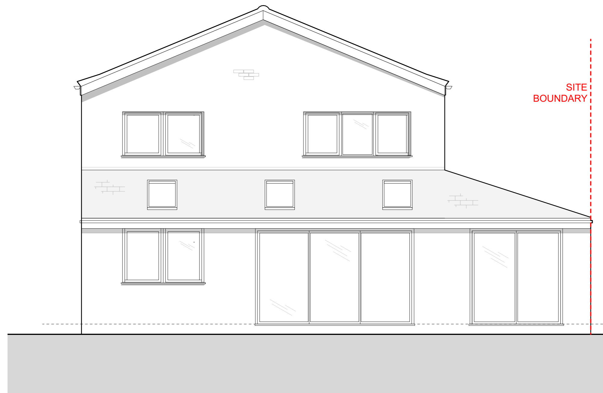
2 NORTH WEST ELEVATION