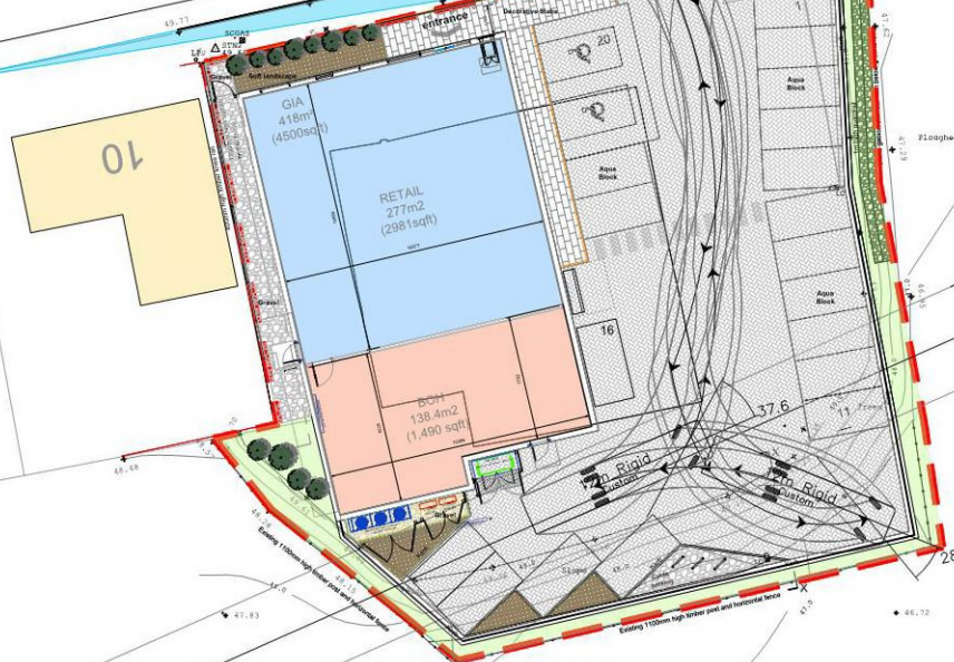
BLOCK PLAN scale 1:250