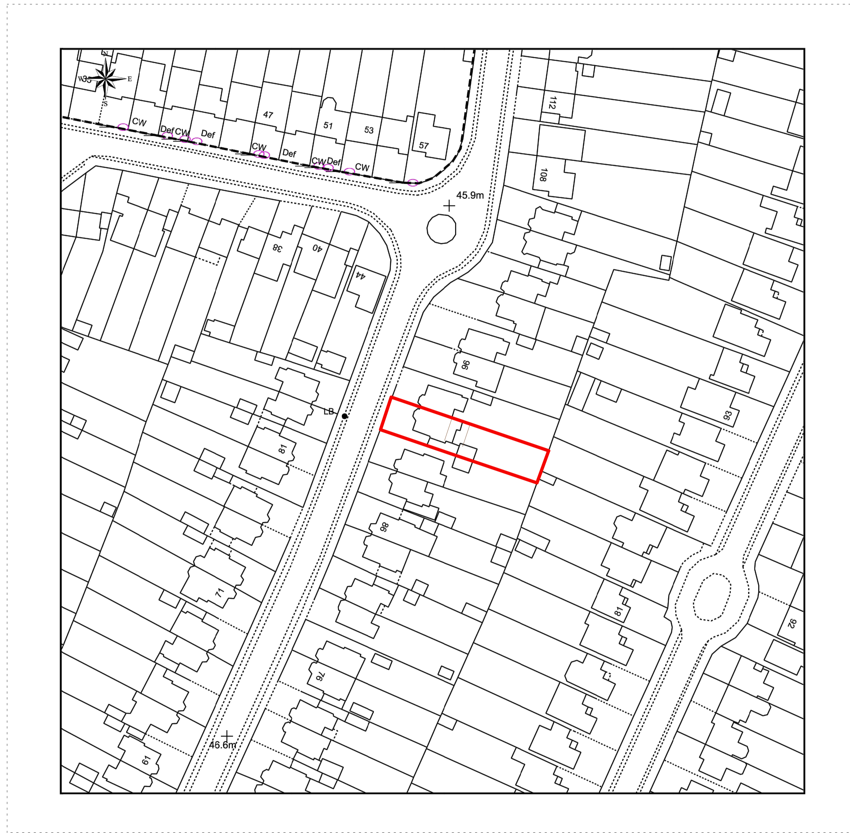
LOCATION PLAN 1:1250@A3

Notes Do not scale from drawing unless for planning purposes. All dimensions to be checked on site. All levels to be checked on site. All setting out must be checked on site. This drawing is copyright WhitemanDesign. This drawing must not be used onsite unless 'Issued for Construction'.