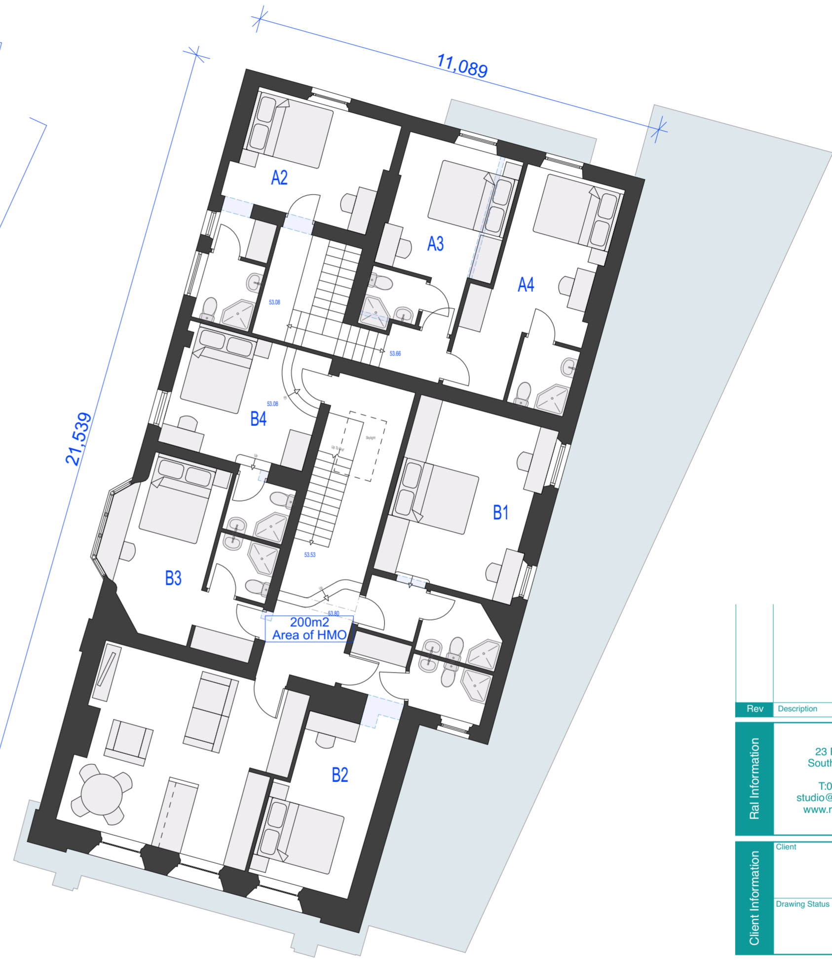
PROPOSED FIRST FLOOR LAYOUT