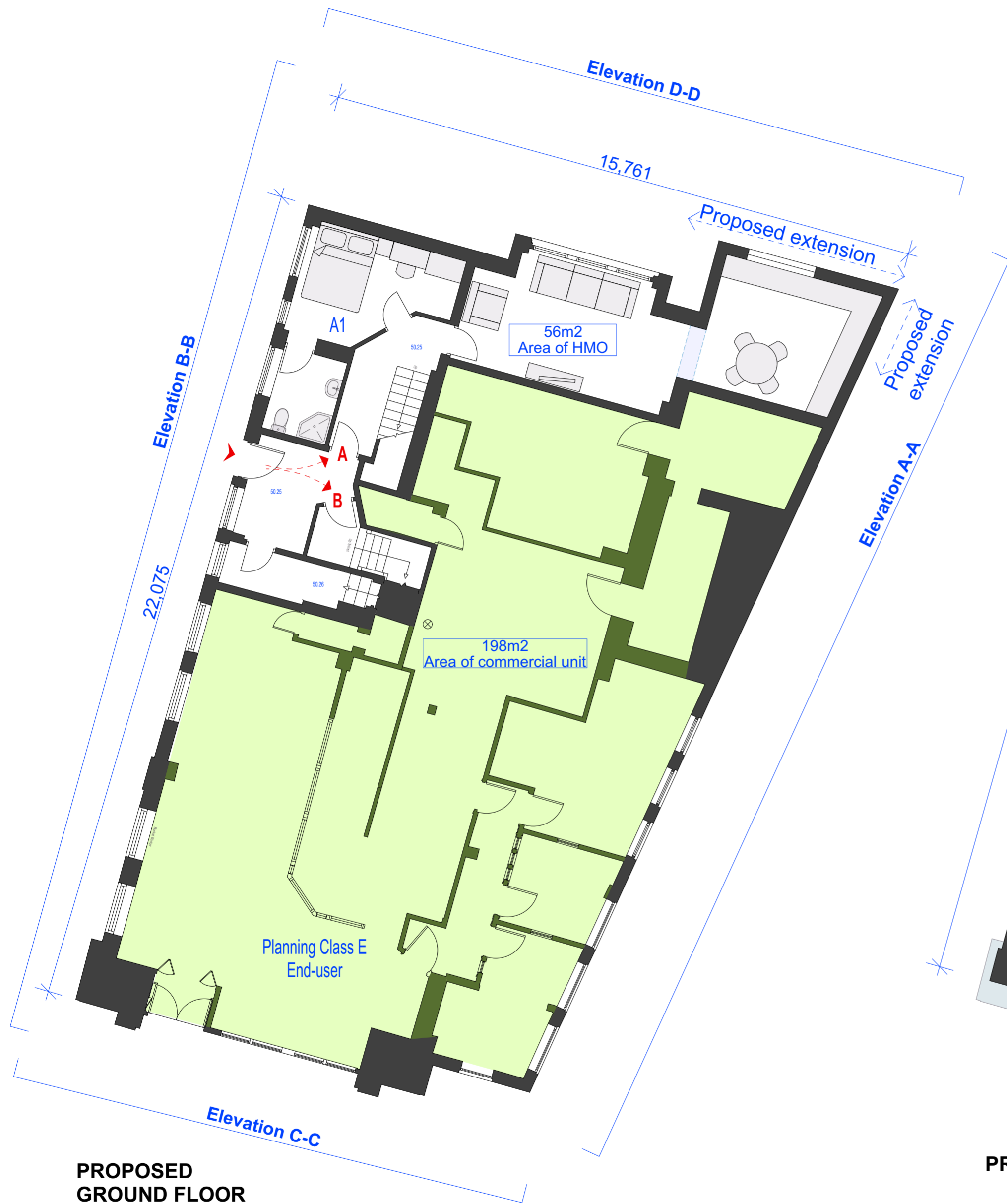
PROPOSED GROUND FLOOR LAYOUT