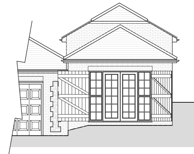
North Elevation (Outer doors open)