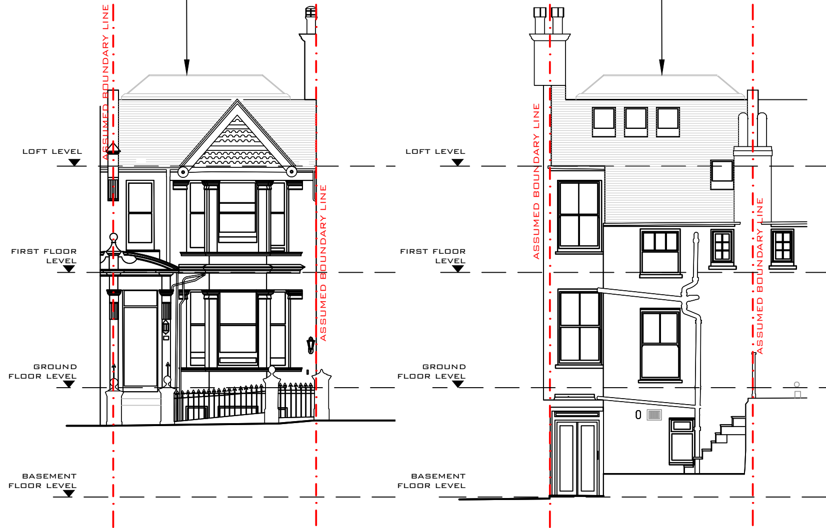
PROPOSED FRONT ELEVATION 1:100 SCALE @ A3

SLIMLINE ROOF LANTERN TO TOP OF FLAT ROOF