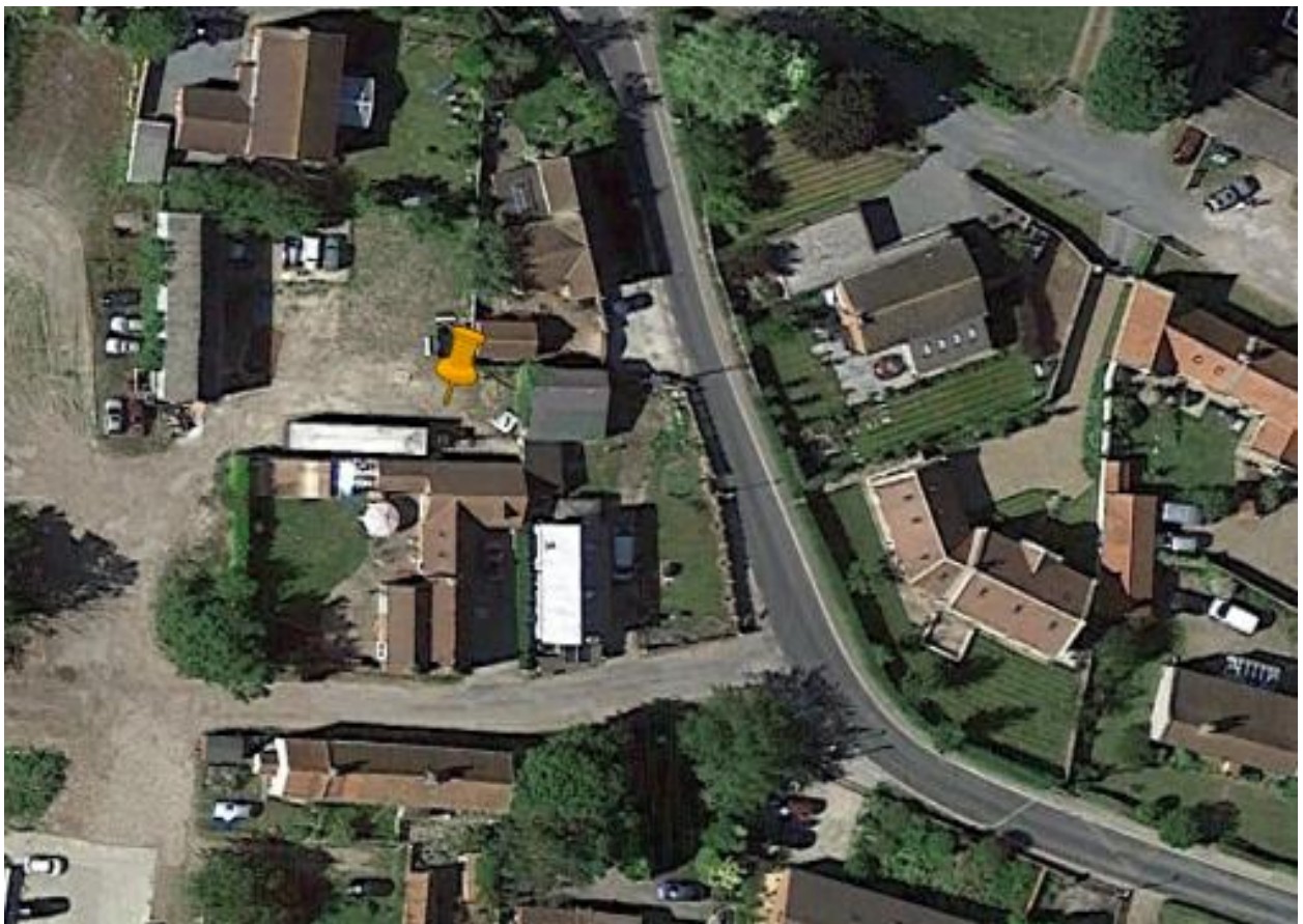
Plate 1: Aerial photograph.