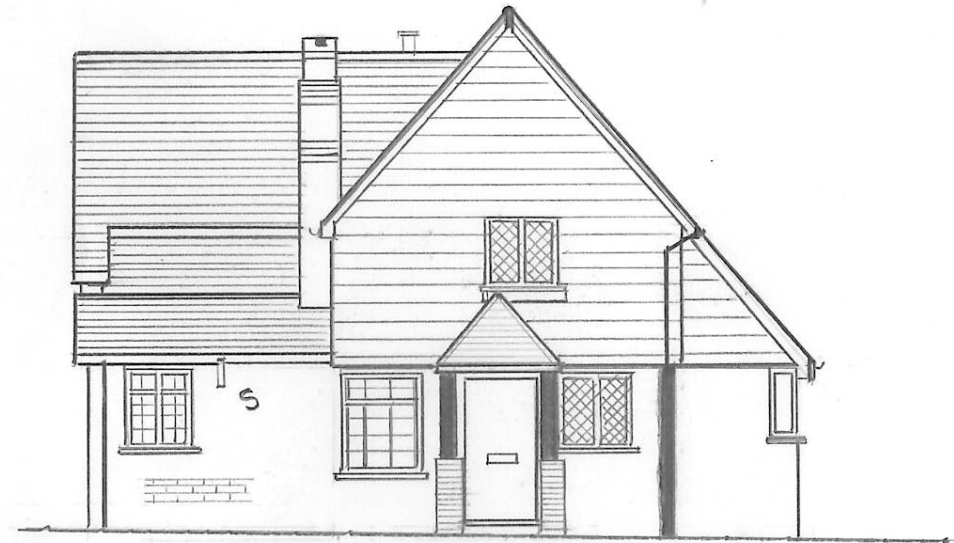
EXISTING SOUTH WEST - SIDE ELEVATION