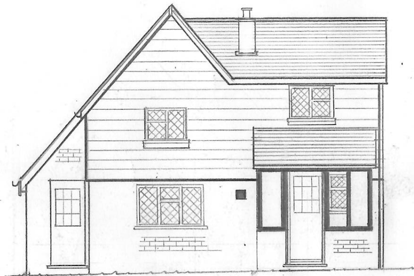
EXISTING NORTH EAST - DRIVEWAY ELEVATION