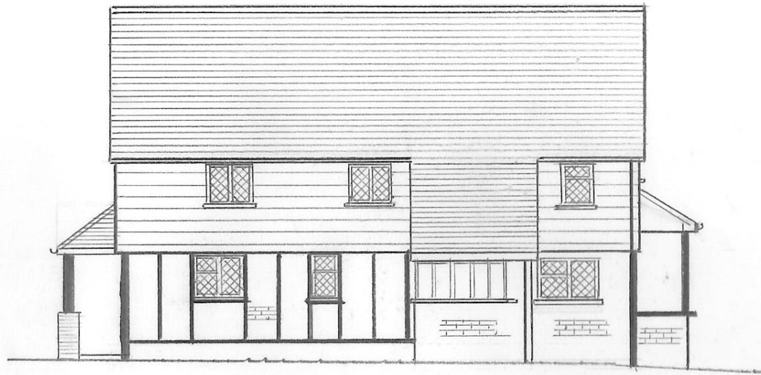
EXISTING SOUTH EAST - ROADSIDE ELEVATION