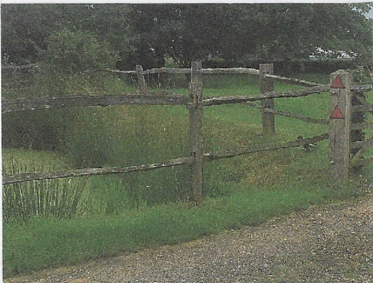
1.2m Post & Rail Fencing.