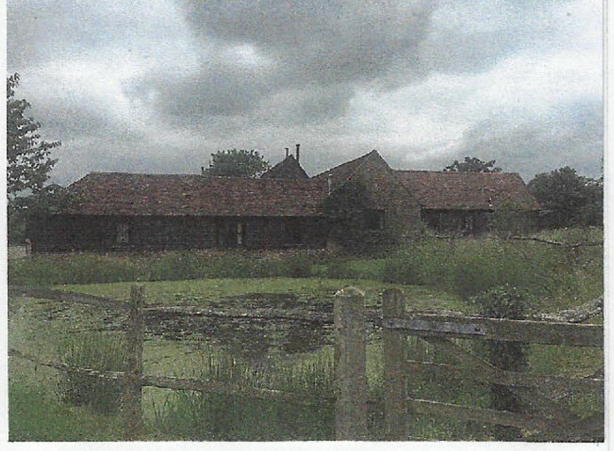
HIPPED AND GABLED MIX OF FARM BUILDINGS.