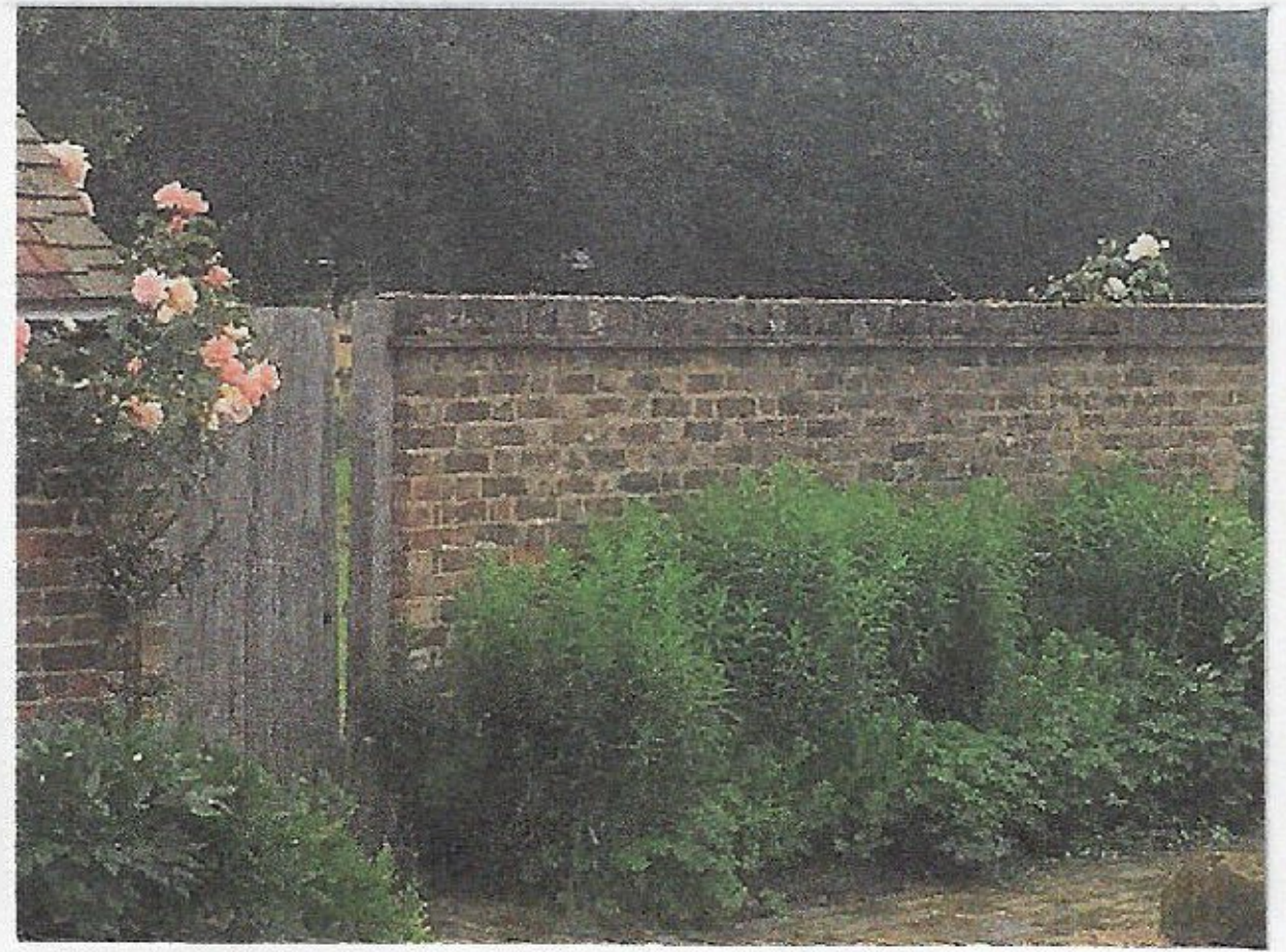
1.8m Break wall