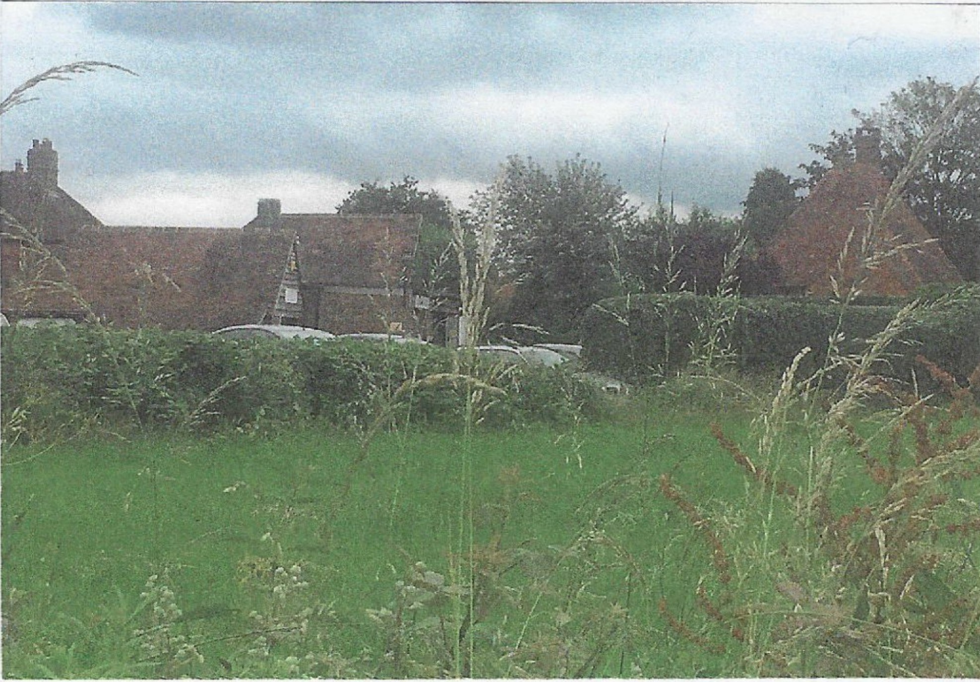
HIPPED AND GABLED SMITHY