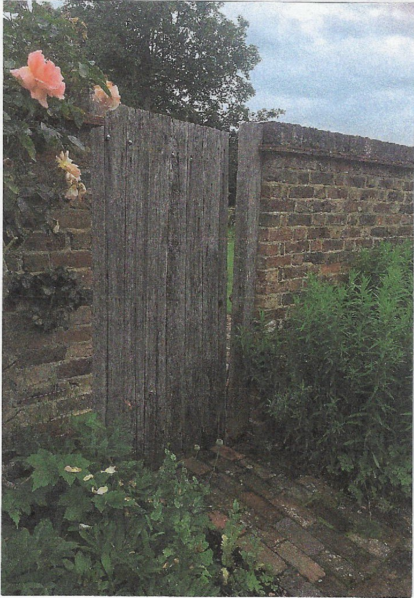
1.8m Break wall - Detail.