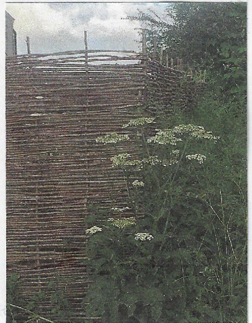
1.8m Hazel Wattle Panels