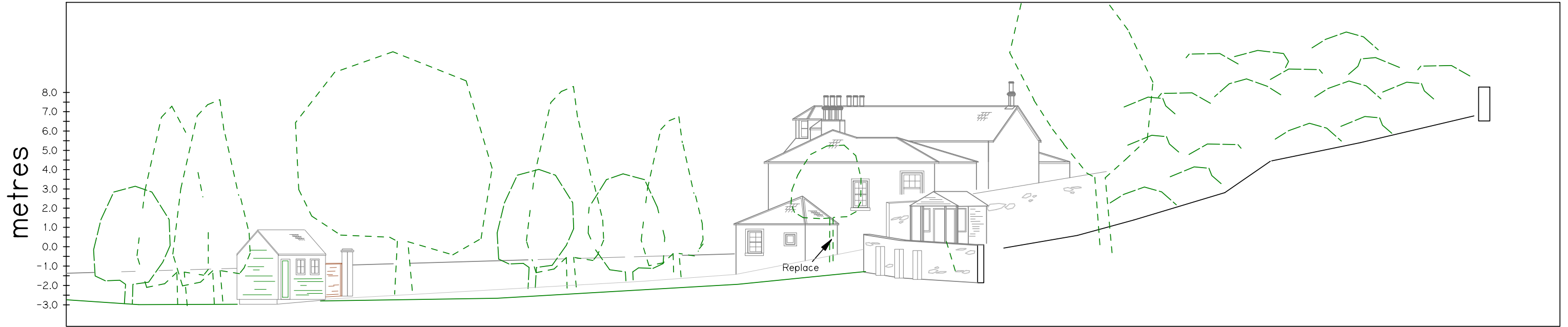
View from West (see Drwg 1110/11 for section lines)