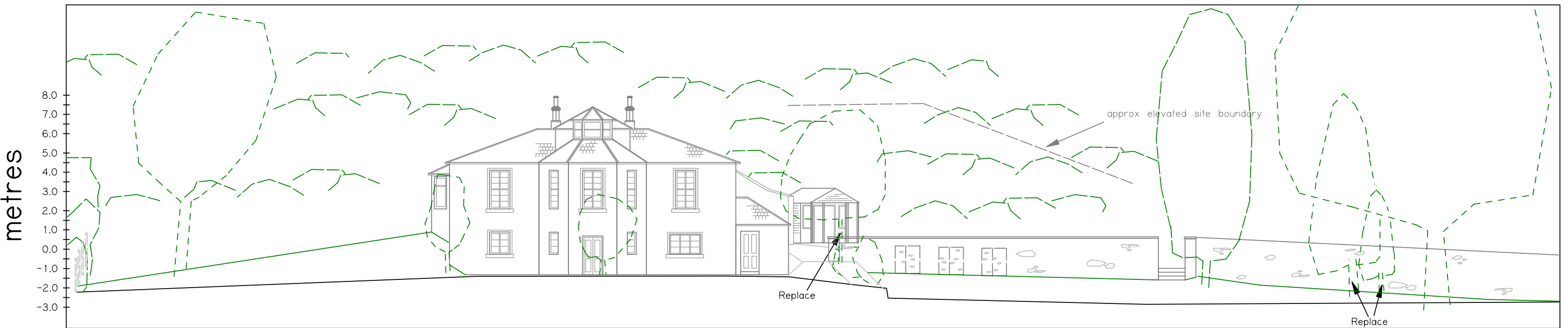
View from South (see Drwg 1110/11 for section lines)