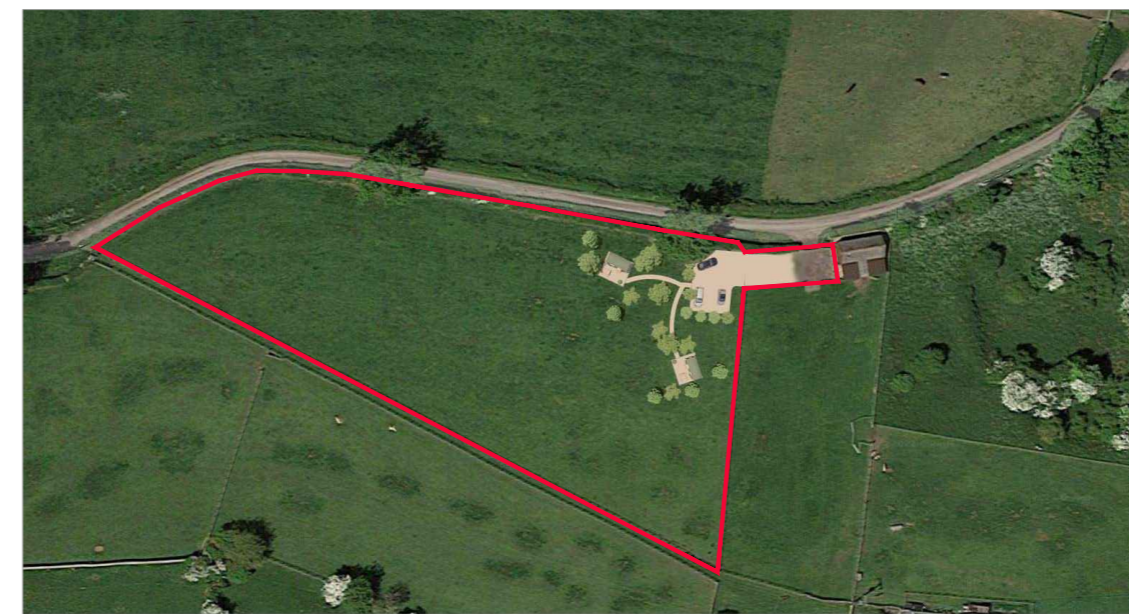
4 – Proposed Rendered Site Plan (Not to scale)