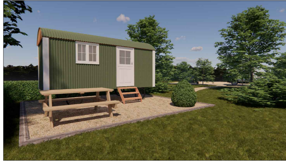
1 – Visual of shepherd Hut 1