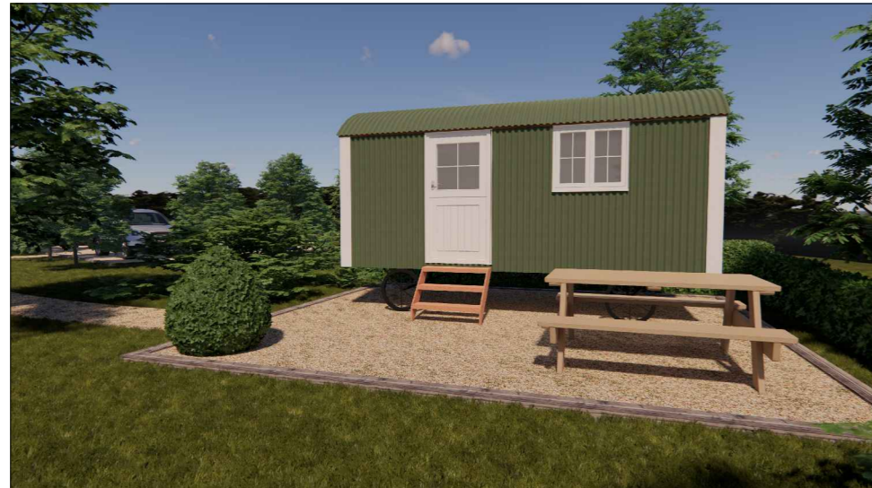
2 – Visual of shepherd Hut 2