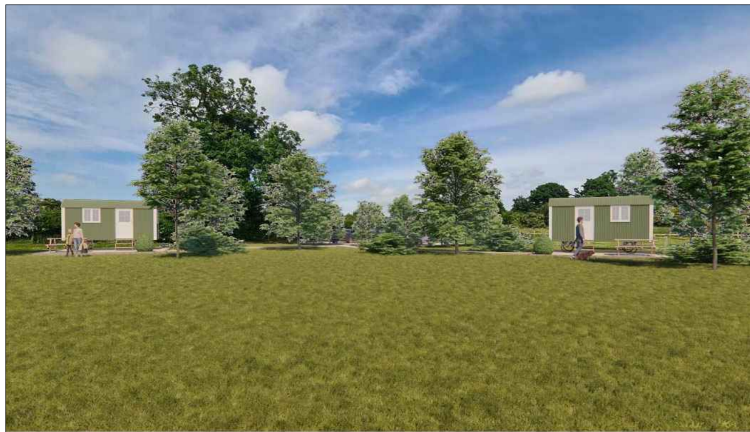
3 – Visual of 2no. huts within landscaping from south west corner of field