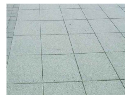
Smooth Ground Aggregate Paving

Cavendish Road Landscape Plan LGF East Scale 1:100 @A3 Sep'21 | 514.02 | LV