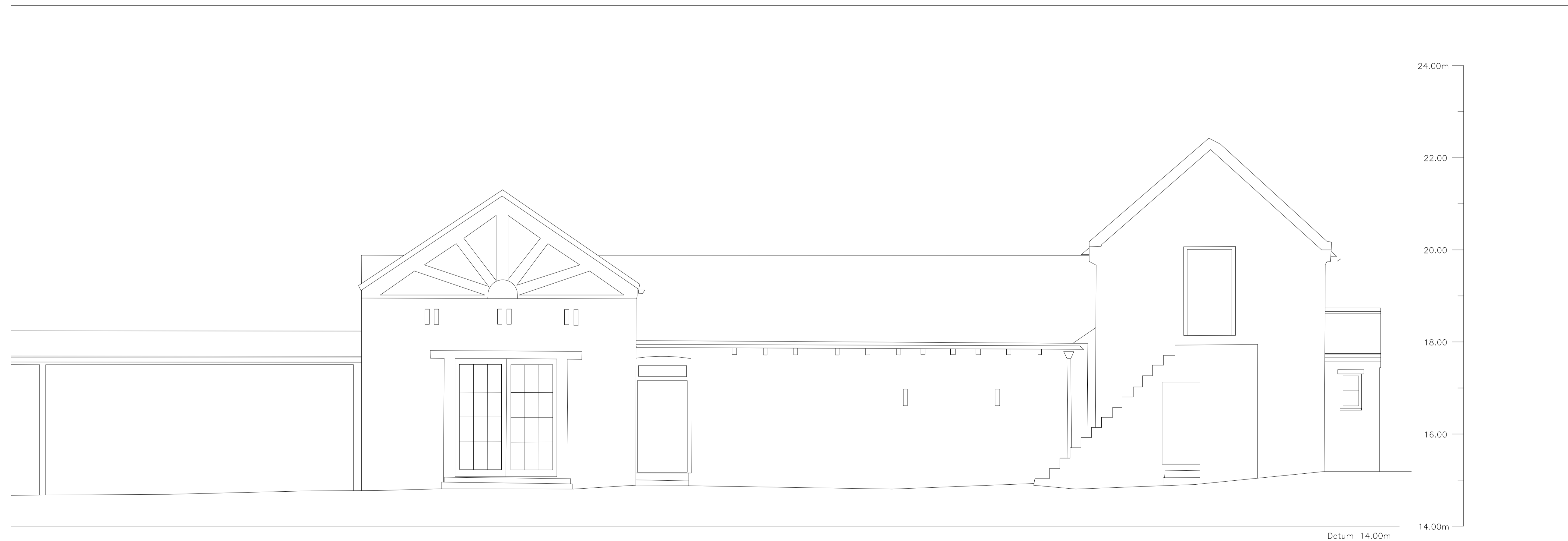
EXISTING ELEVATION 06 - PART ELEVATION