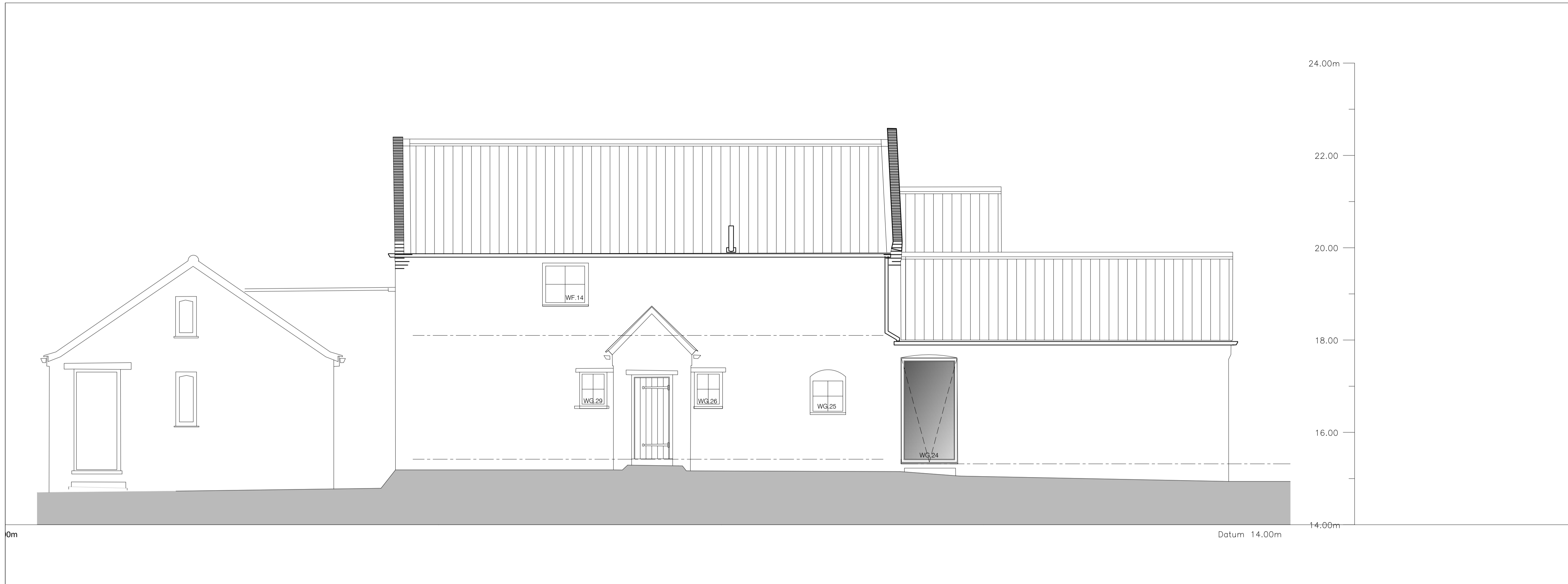
PROPOSED ELEVATION 01 - NORTH WEST

Do not scale from this drawing Drawing to be read in conjunction with the specification document Contractor to check all dimensions on site and notify Vincent and Brown of any discrepancies prior to commencement of the works