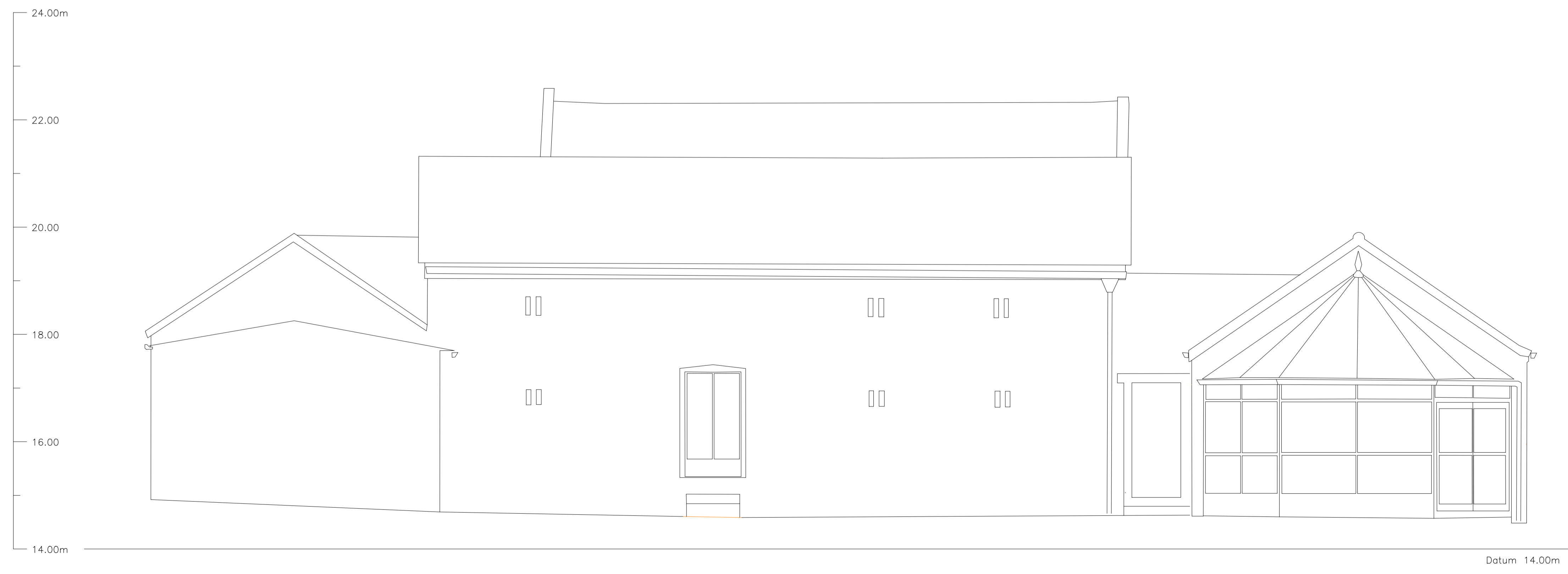
EXISTING ELEVATION 05